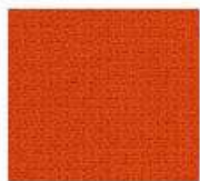
L11 - Orange