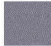
C11 - Grey