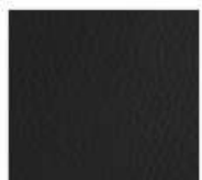
D11 - Black