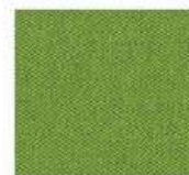
C16 - Light green