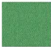
C18 - Green