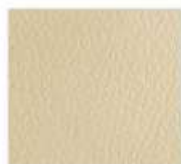
D16 - Ivory