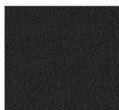
C14 - Black