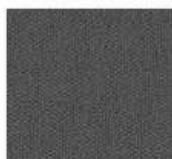
C13 - Dark grey