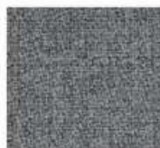
L12 - Light grey melange