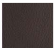
D19 - Dark brown