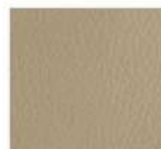
D17 - Light brown