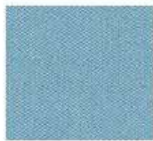
C20 - Light blue