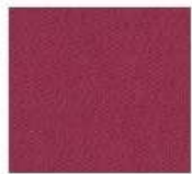
C17 - Dark pink