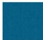
C15 - Dark blue