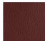
D18 - Brown