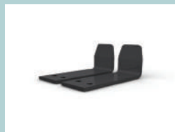
Linking parts (2 pcs.)