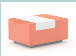
Metal table placed on the pouf (black or white colour)