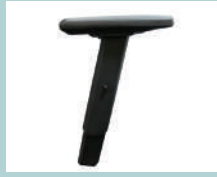
Height adjustable armrests