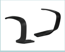
Fixed plastic armrests