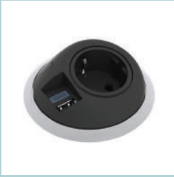
Power socket SHZ004