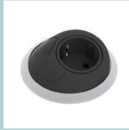
Power socket SHZ005