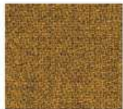
L16 - Dark yellow melange