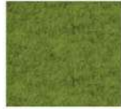
GT3 - Light green melange