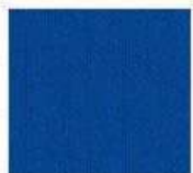
C12 - Bright blue