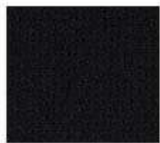
L01 - Black