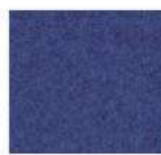
S68 - Royal blue melange