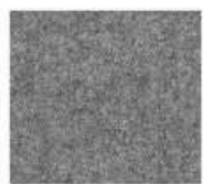
S16 - Grey melange