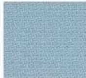
L07 - Light blue