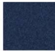
S62 - Midnight blue melange