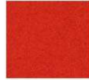
GT5 - Light red