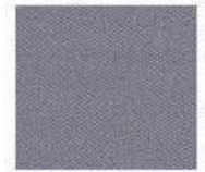
C11 - Grey