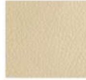
D16 - Ivory