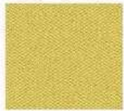
C03 - Yellow