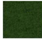
GT0 - Green melange