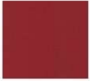
D08 - Cherry red