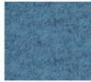
GT9 - Light blue melange