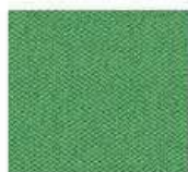
C18 - Green