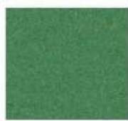
S53 - Green melange