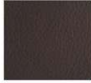
D19 - Dark brown