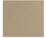
D17 - Light brown