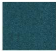
S59 - Dark teal melange