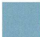
C20 - Light blue