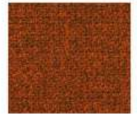
L10 - Orange melange