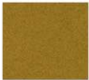
GU3 - Mustard