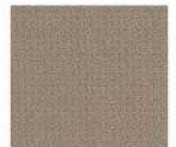
L15 - Beige