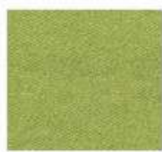
S46 - Light green melange