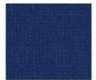
L05 - Blue