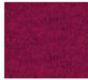
GP5 - Dark pink melange