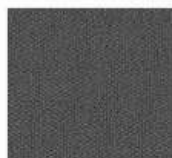
C13 - Dark grey