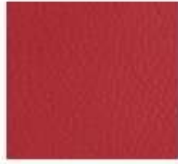
D15 - Red