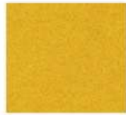
GP3 - Yellow