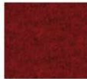
GU5 - Red melange