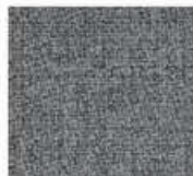
L12 - Light grey melange