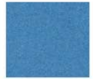
GT1 - Light blue