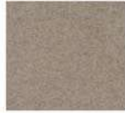
GT4 - Cappuccino