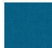
C15 - Dark blue