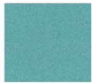
S55 - Light mint colour