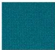
L03 - Turquoise