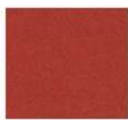
S84 - Red