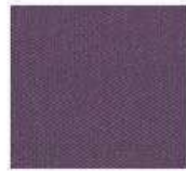
C09 - Purple