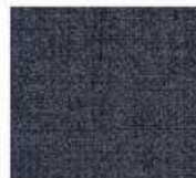
L14 - Grey-blue melange