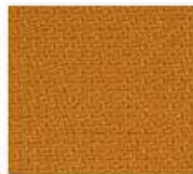
L17 - Dark yellow