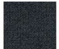
L20 - Dark grey melange