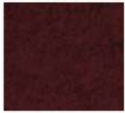
GT7 - Claret melange