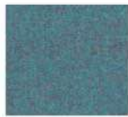
S56 - Mint colour melange