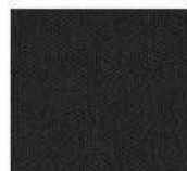
C14 - Black