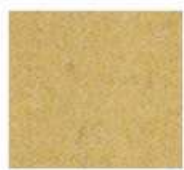
S45 - Yellow melange