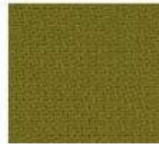
L09 - Green