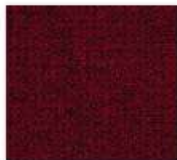
L18 - Red melange