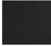
D11 - Black