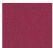
C17 - Dark pink