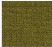
L08 - Green melange