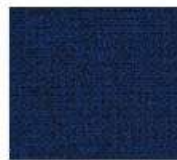
L04 - Blue melange