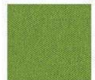
C16 - Light green