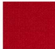
L19 - Red