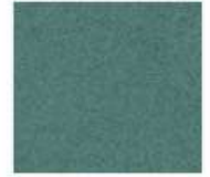
GT6 - Mint