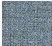
L06 - Light blue melange