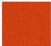
L11 - Orange