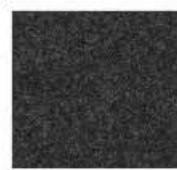
S17 - Black melange