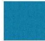
C10 - Blue