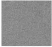
GT2 - Grey