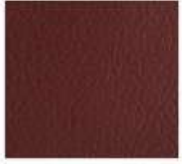
D18 - Brown