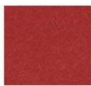
S85 - Red melange