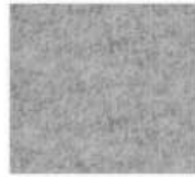
GT8 - Light grey melange