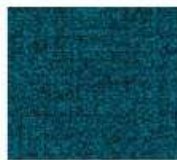
L02 - Turquoise melange