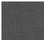
L13 - Grey