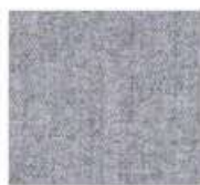
S08 - Light grey melange