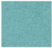
GP1 - Light mint