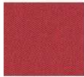
C06 - Red