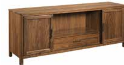
315-585 Virtue Entertainment Console W78 D19 H30 Two sliding doors, one drawer, one adjustable glass shelf in center, one adjustable wood shelf behind each end door, two adjustable wood shelves total, cord exits, center foot, adjustable levelers, ventilation slots behind door Pages 30/31, 32