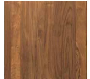
Finish: Walnut Hardware: Polished Brass