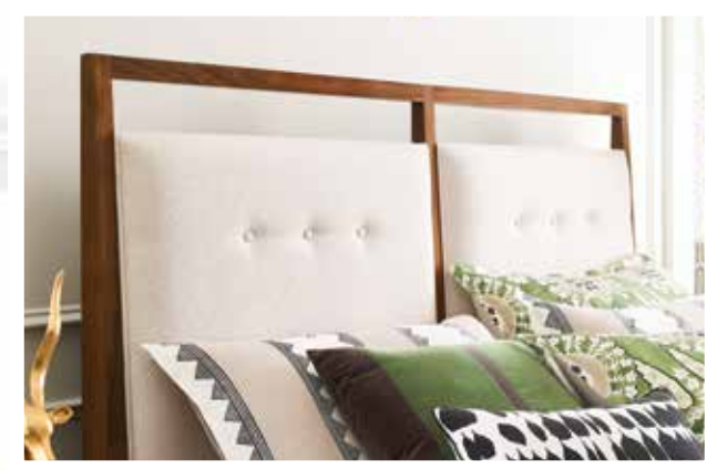
315-316P Pinehurst Upholstered King Bed (headboard detail)