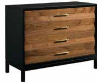
315-933B Backbay Accent Chest W46 D19 H36 Four drawers, adjustable levelers, black accent finish Pages 1, 18