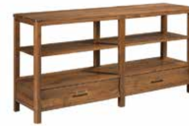
315-925 Boca Console Table W64 D17 H32 Two adjustable wood shelves, two drawers Pages 33