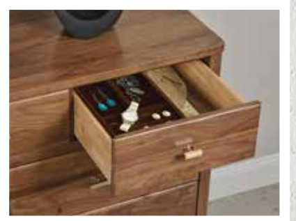
315-316P Flat Top Nine Drawer Dresser (drawer detail)