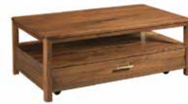
315-910 Parkway Coffee Table W48 D28 H18-1/2 Wood shelf, one drawer, casters Pages 28/29, 30/31