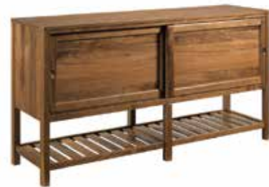
315-850 Roanoke Buffet W70 D19 H38 Two sliding doors, one adjustable wood shelf behind each end door, two adjustable wood shelves total, slatted wood shelf at bottom, hand holds in back of case, adjustable levelers Pages 16/17, 19, 20/21, 24/25

Table Sizes: W76 D42 H30 (with no leaf) W96 D42 H30 (with one leaf) W116 D42 H30 (with two leaves) Pages 15, 16/17, 20/21, 24/25