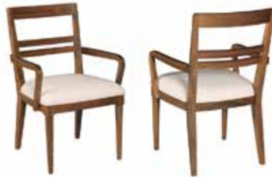
315-639 Clubhouse Arm Chair W23 D23-1/2 H36 Upholstered seat and wood back Seat height: 19 Seat depth: 19 Seat height: 24-3/4 Pages 16/17