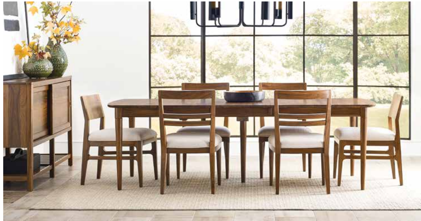
315-744 Hudson Rectangular Dining Table 315-622 Mackie Dining Chair 315-638 Clubhouse Side Chair 315-850 Roanoke Buffet