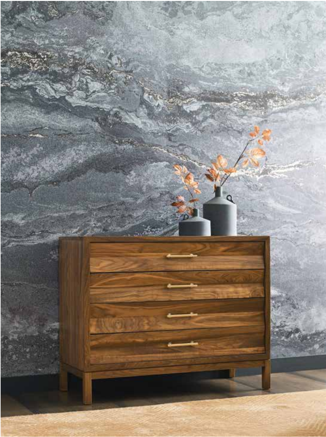
315-933 Backbay Accent Chest