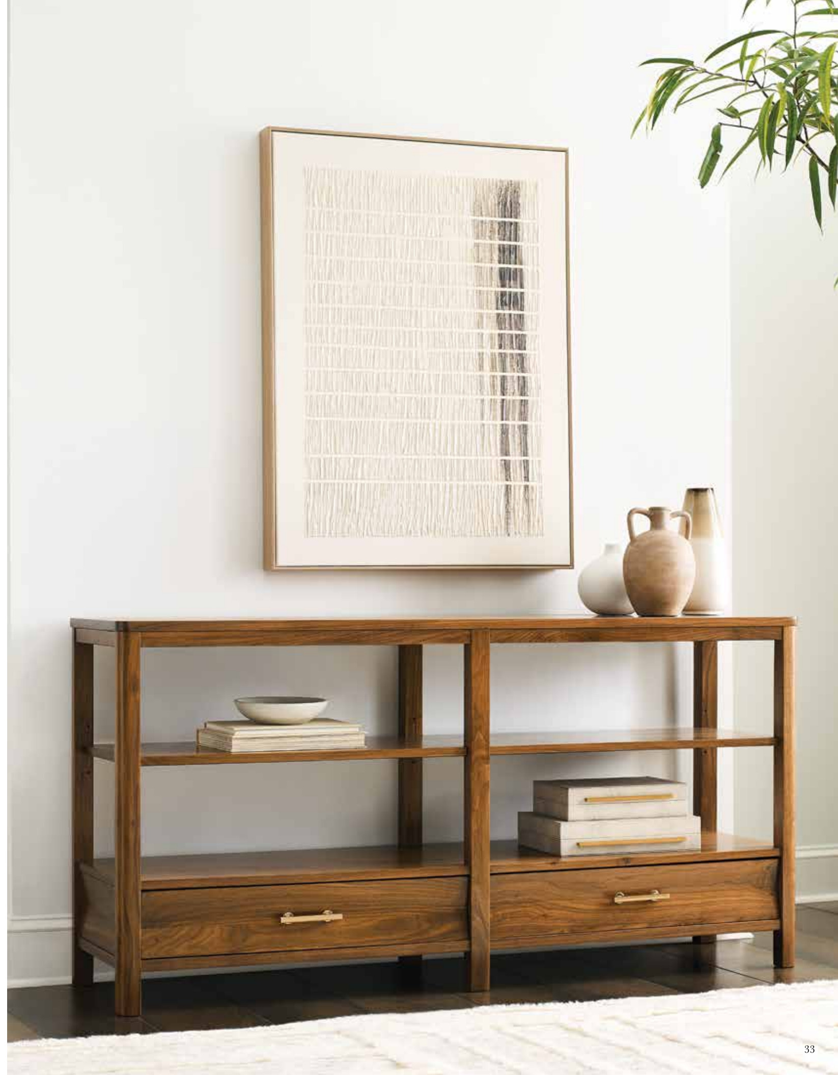
Opposite Page | 315-925 Boca Console Table