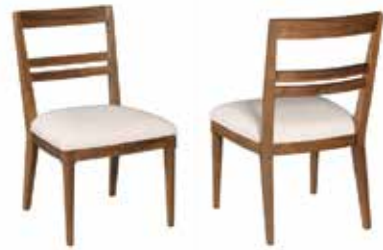
315-638 Clubhouse Side Chair W20-1/2 D23-1/2 H36 Upholstered seat and wood back Seat height: 19 Seat depth: 19 Pages 16/17, 22