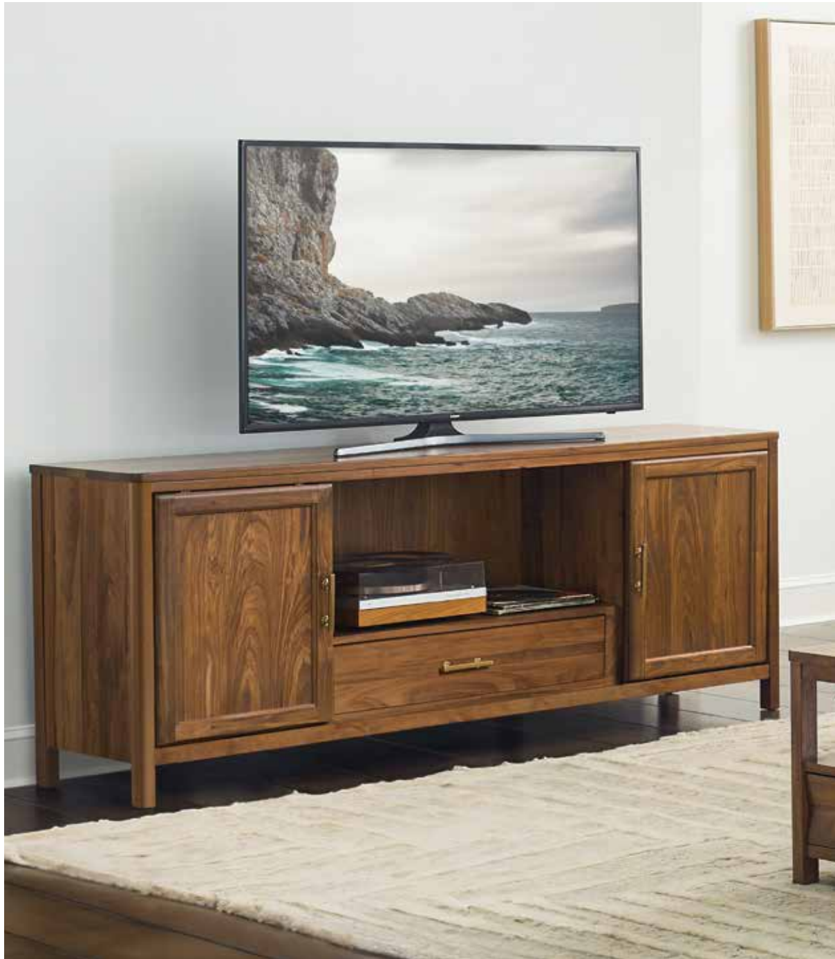
315-585 Virtue Entertainment Console