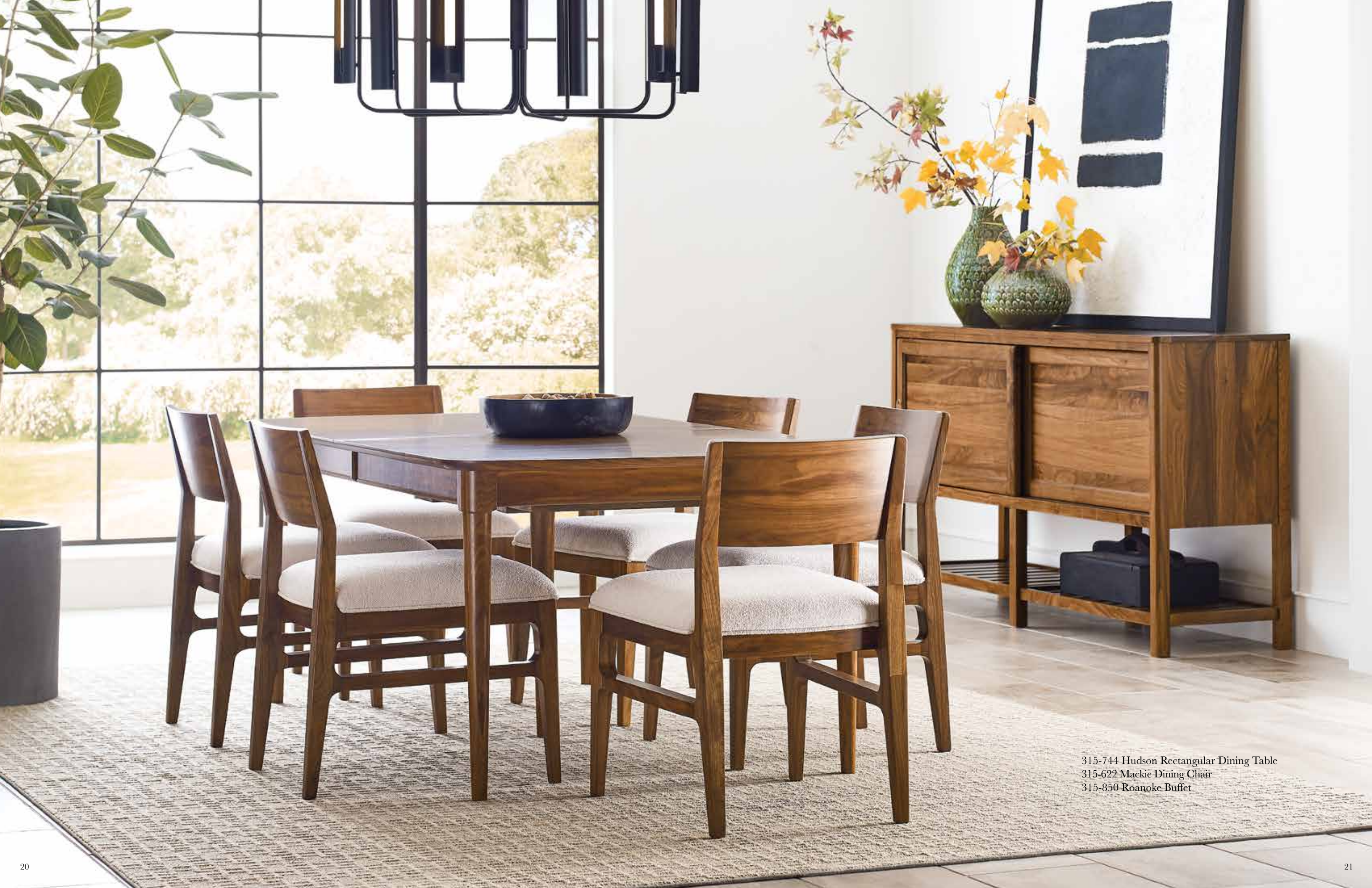
315-744 Hudson Rectangular Dining Table 315-622 Mackie Dining Chair 315-850 Roanoke Buffet