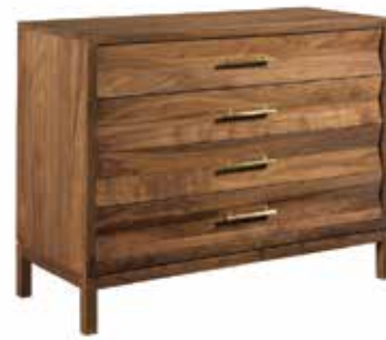
315-933 Backbay Accent Chest W46 D19 H36 Four drawers, adjustable levelers Pages 13