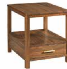
315-915 Parkway End Table W23 D27 H26 Wood shelf, one drawer Pages 27, 28/29, 30/31