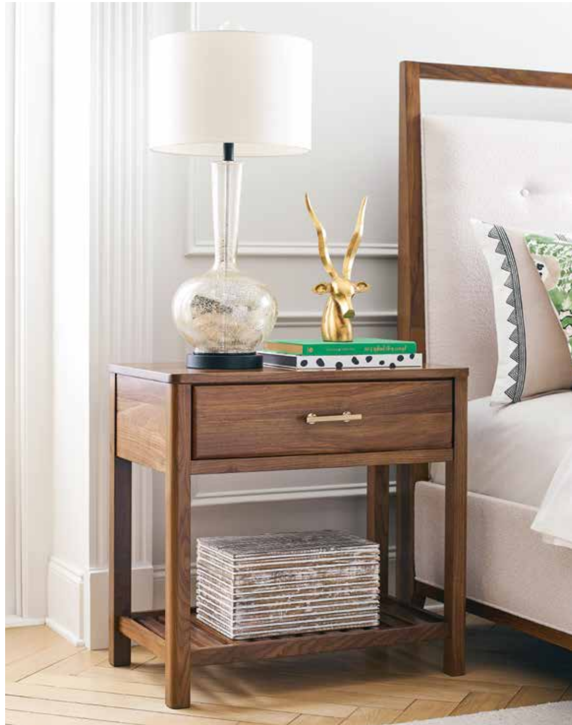
315-422 Highland Open Nightstand