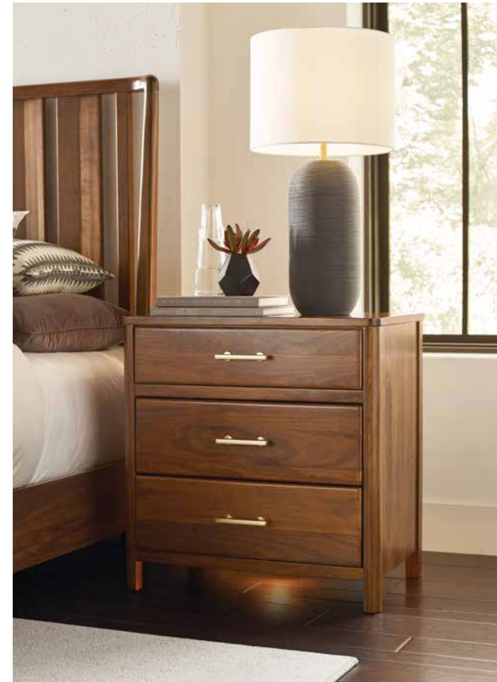
315-421 Main Nightstand nightlight on