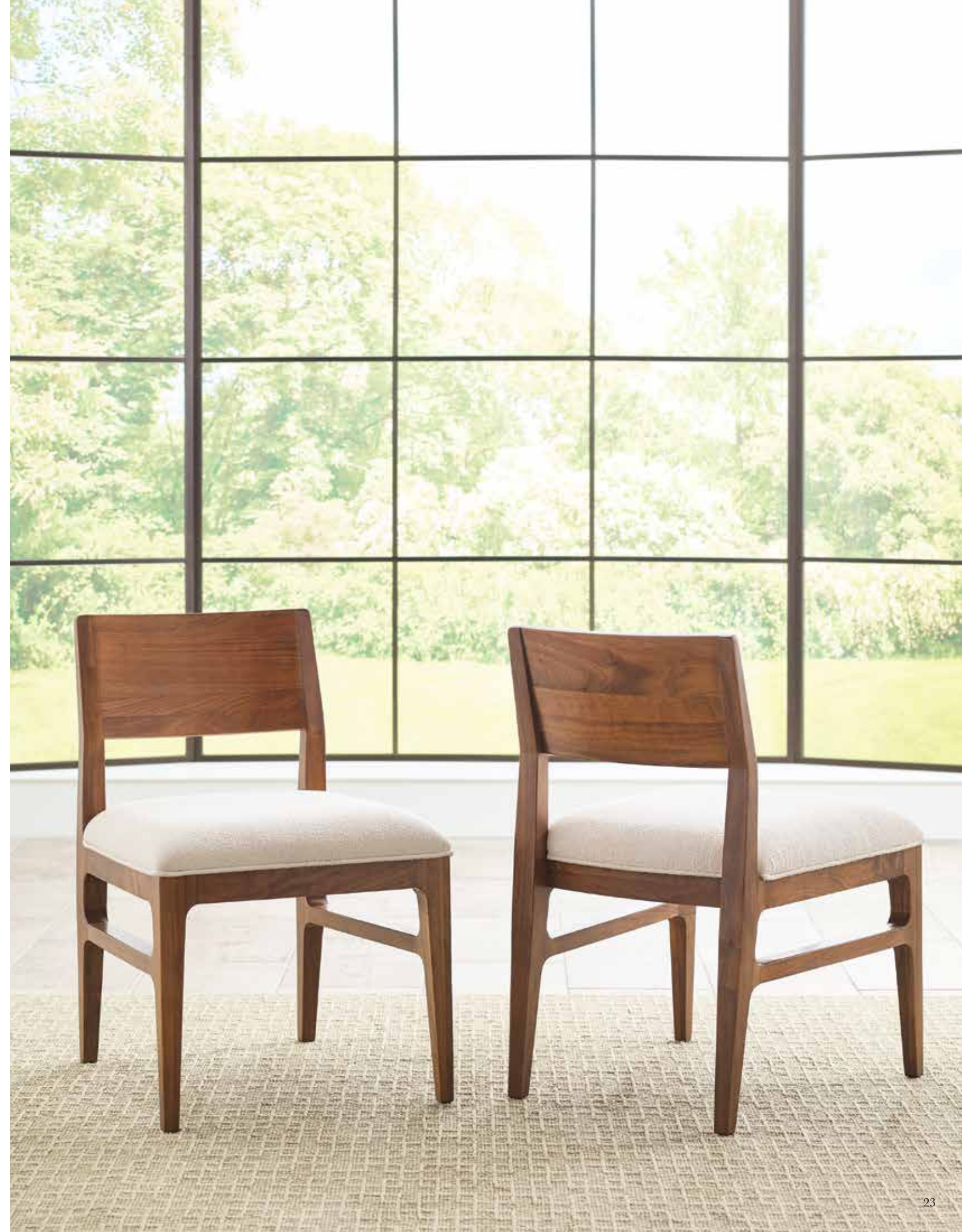
Opposite Page | 315-622 Mackie Dining Chair