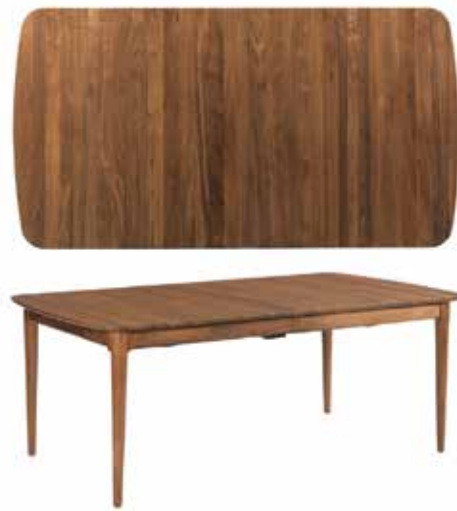
315-744 Hudson Rectangular Dining Table W76 D42 H30 Adjustable levelers, two 20" leaves, one leaf is self storing

Table Sizes: W76 D42 H30 (with no leaf) W96 D42 H30 (with one leaf) W116 D42 H30 (with two leaves) Pages 15, 16/17, 20/21, 24/25