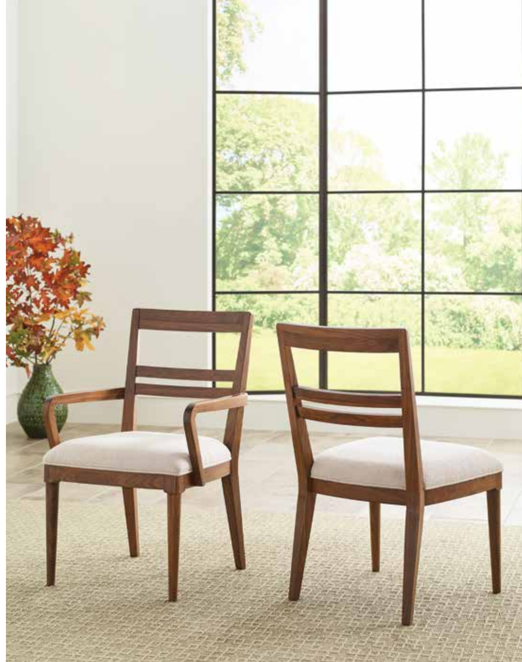
315-639 Clubhouse Arm Chair, 315-638 Clubhouse Side Chair