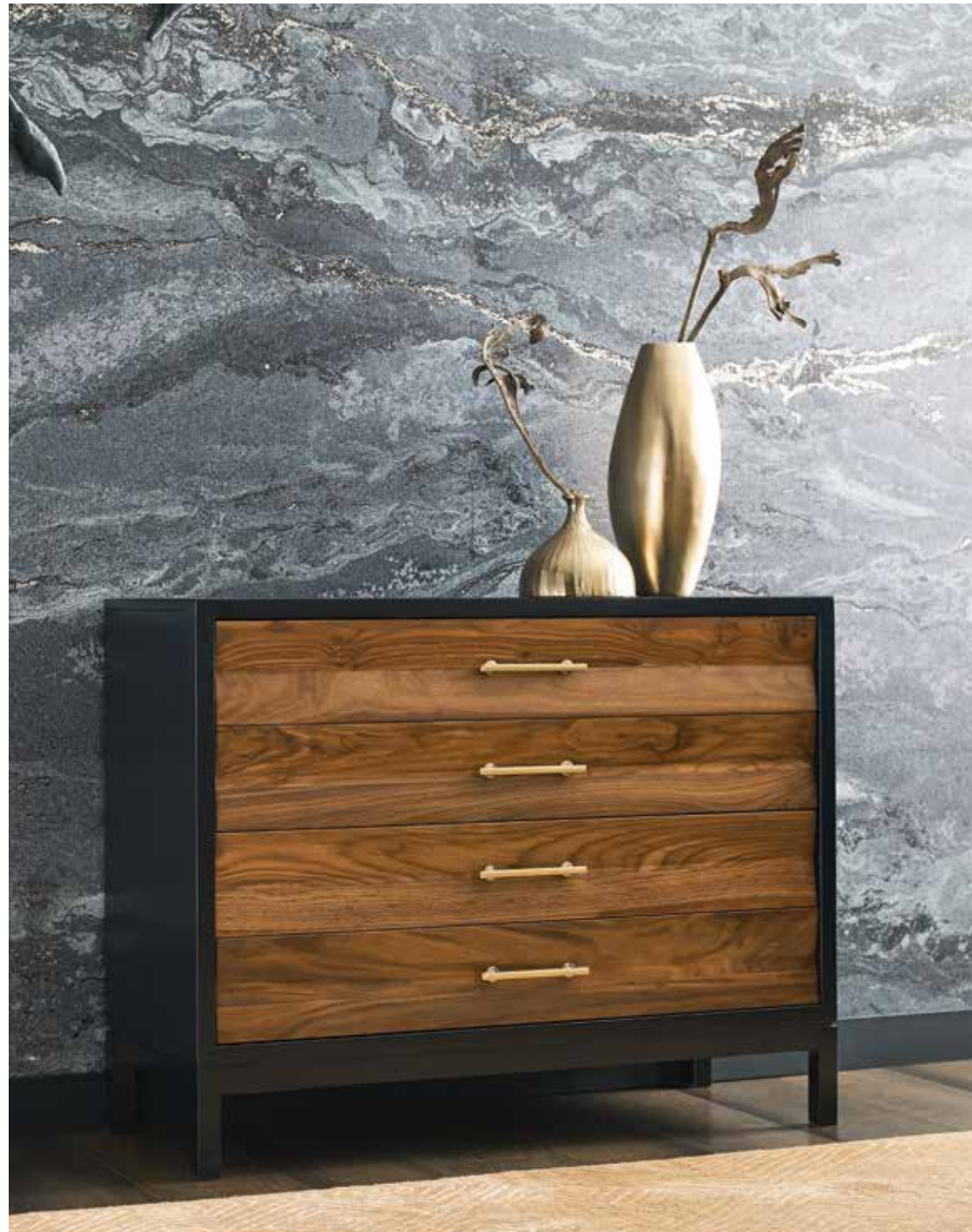
315-933B Backbay Accent Chest