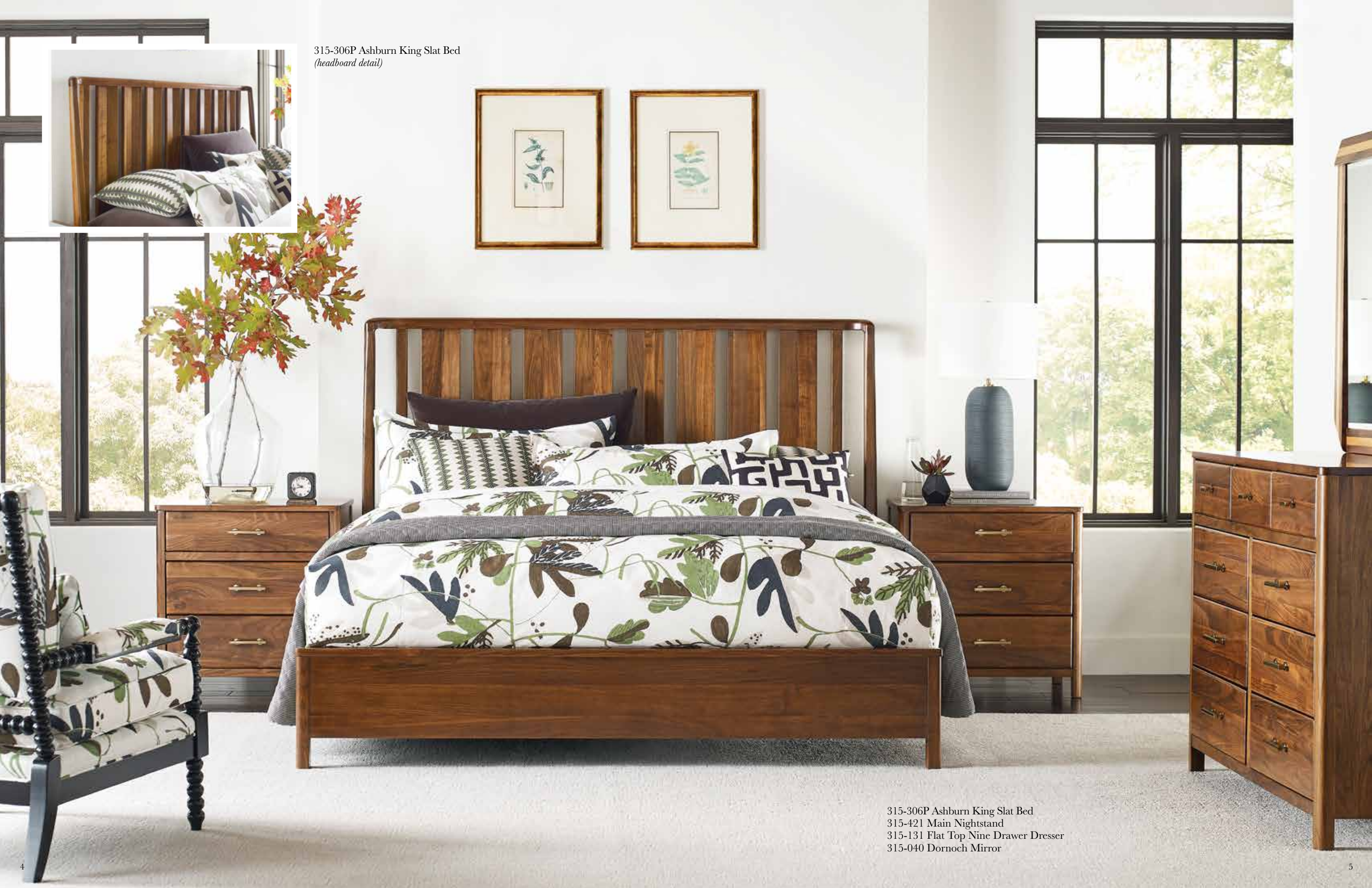
315-306P Ashburn King Slat Bed 315-421 Main Nightstand 315-131 Flat Top Nine Drawer Dresser 315-040 Dornoch Mirror