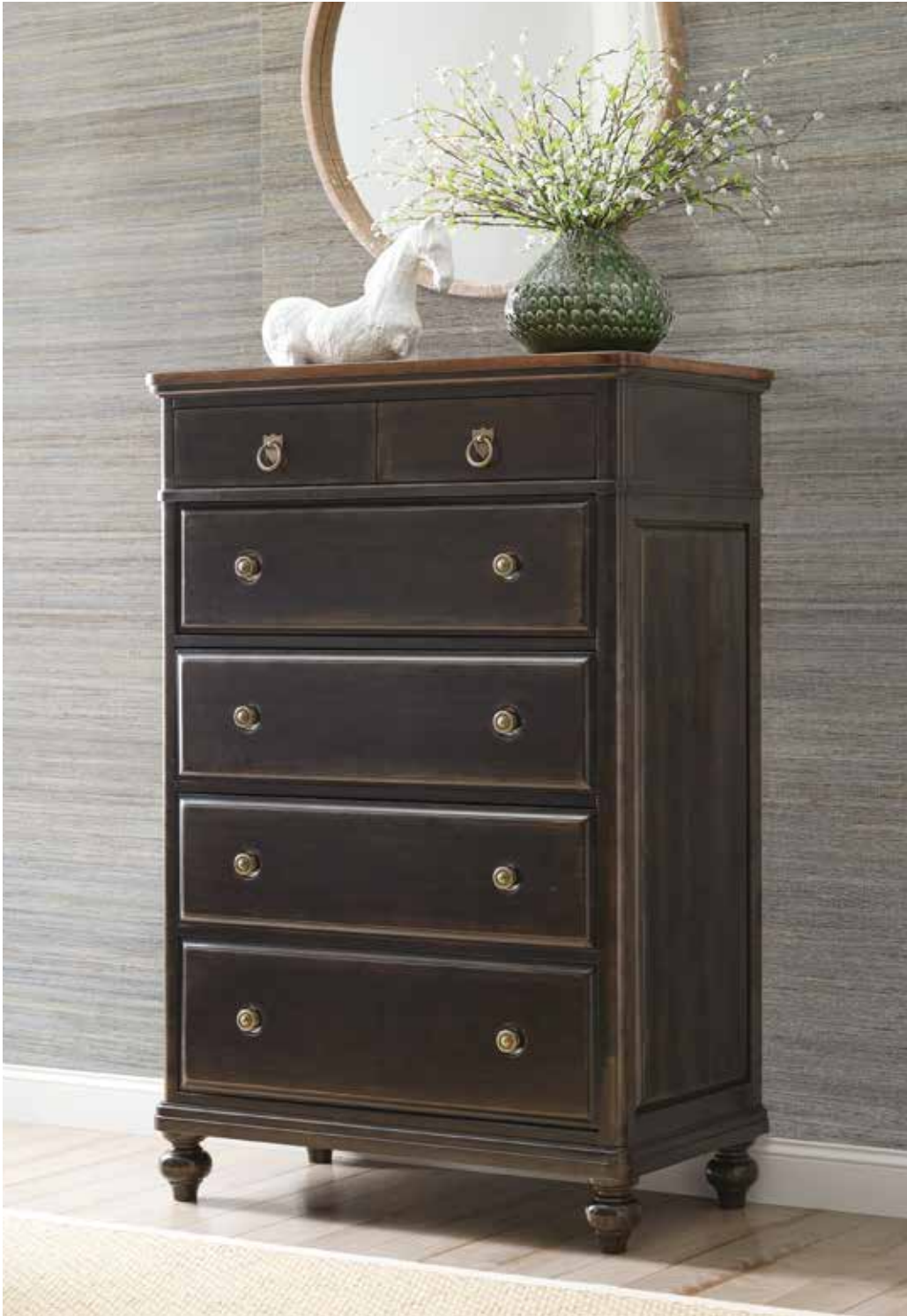
487-216B Harrison Drawer Chest