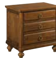
487-420 Harrison Nightstand W28 D18 H29 Three drawers, night light, electric outlet on back of case, adjustable levelers Pages 4/5, 8/9