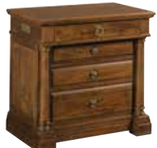
487-422 Bridgetown Bachelor's Chest W32 D20 H32 Four drawers, electric outlet on back of case, hidden storage area at bottom, adjustable levelers Pages 10/11