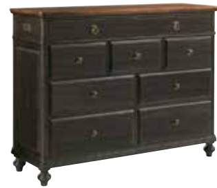
487-210B Harrison Bureau - Black W62 D20 H48 Nine drawers, adjustable levelers, center foot, removable brown jewelry tray in top right drawer Pages 12/13, 16