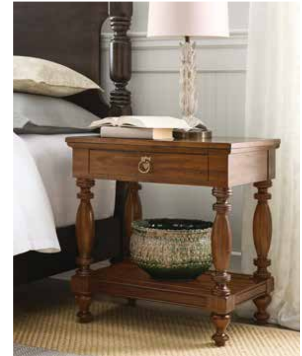
487-421 Warren Bedside Table night light on