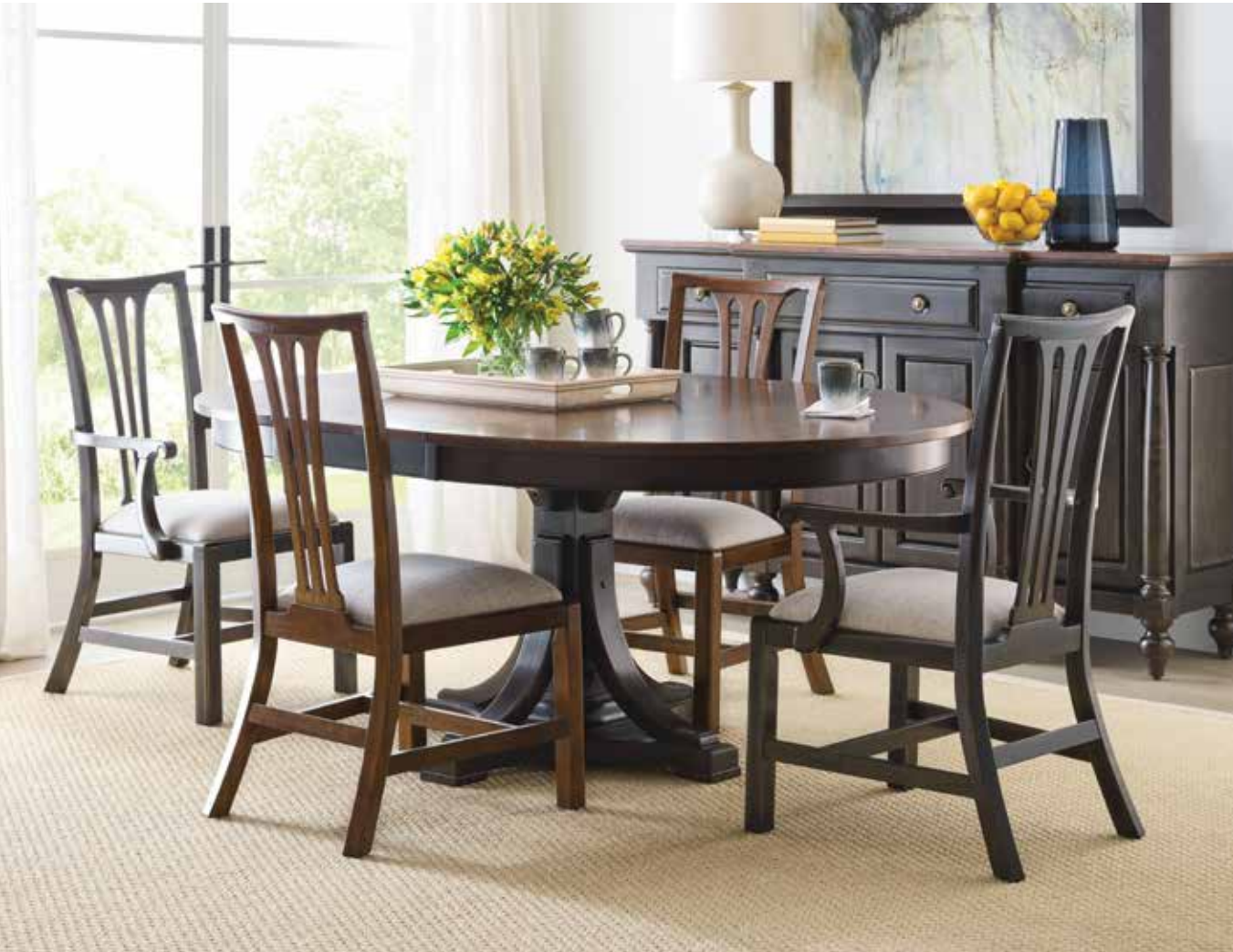
487-701P Broomefield Round Dining Table Package, 487-623B Fitts Arm Chair, 487-622 Fitts Side Chair, 487-858B Harrison Credenza