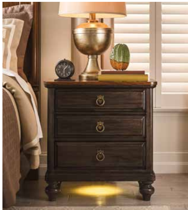
487-420B Harrison Nightstand night light on