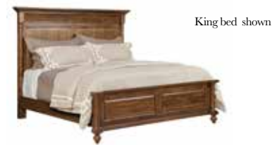
487-304P Kensington Queen Panel Bed Package (5/0) W68-3/4 D92-1/4 H68

consists of: -304 Kensington Queen Panel Bed Headboard - 5/0 W68-3/4 D6 H68 -305 Kensington Queen Panel Bed Footboard with rails and slats - 5/0 W65-1/4 D4-1/4 H24