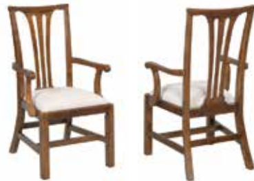
487-623 Fitts Arm Chair W22-11/16 D23-1/2 H40 Upholstered seat and wood back Seat height: 19 Seat depth: 18 Seat depth: 25-5/8 Pages: 24/25, 29