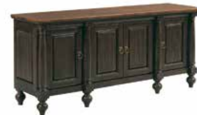
487-585B Harrison Console - Black W72 D20 H32 Four doors, adjustable wood shelf behind two center doors, adjustable wood shelf behind each end door, three adjustable wood shelves total, cord exits, center foot, electrical outlet in center adjustable leveler Pages: 38/39, 40/41