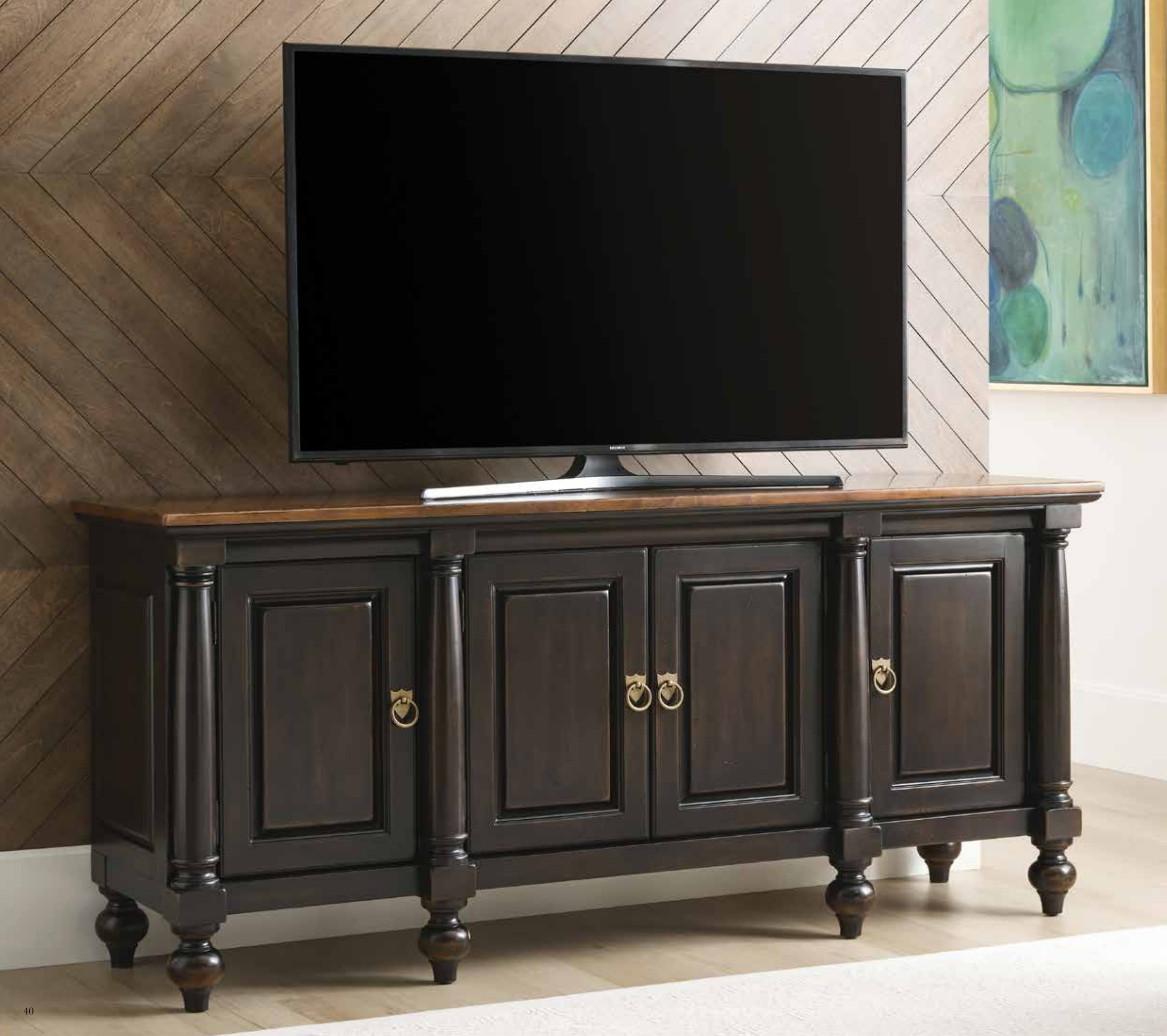
487-585B Harrison Console