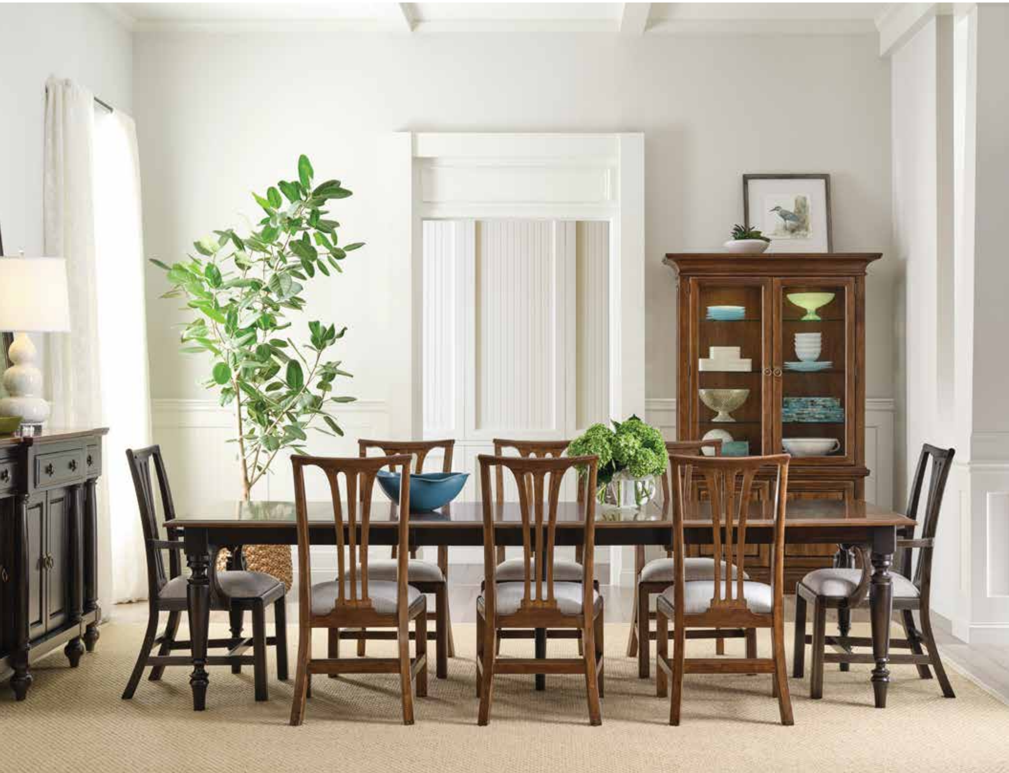
487-744B Nicholas Leg Table, 487-623B Fitts Arm Chair, 487-622 Fitts Side Chair, 487-830P Connell China, 487-858B Harrison Credenza