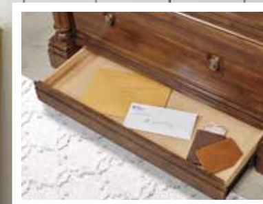
487-215 Bridgetown Chest bottom hidden drawer detail