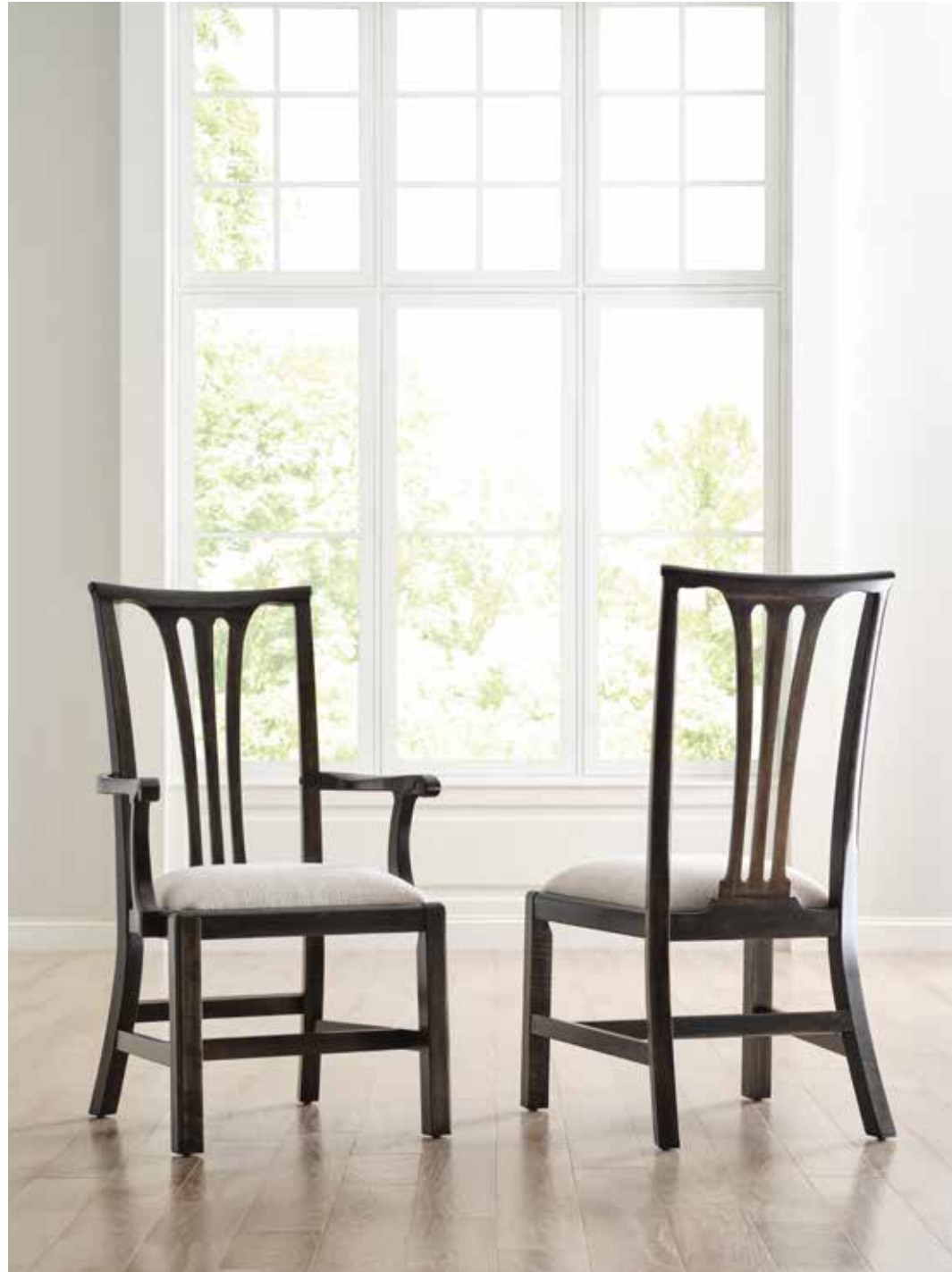
487-623B Fitts Arm Chair, 487-622B Fitts Side Chair

Opposite Page | 487-623 Fitts Arm Chair, 487-622 Fitts Side Chair