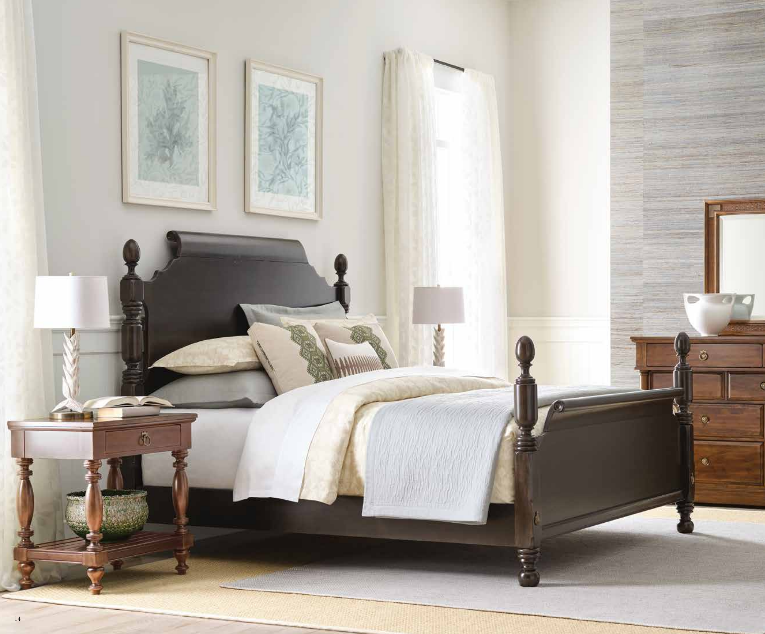
487-326BP Brighton King Poster Bed Package 487-421 Warren Bedside Table 487-020 Bridgetown Mirror