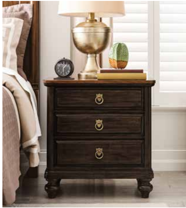
487-420B Harrison Nightstand night light on