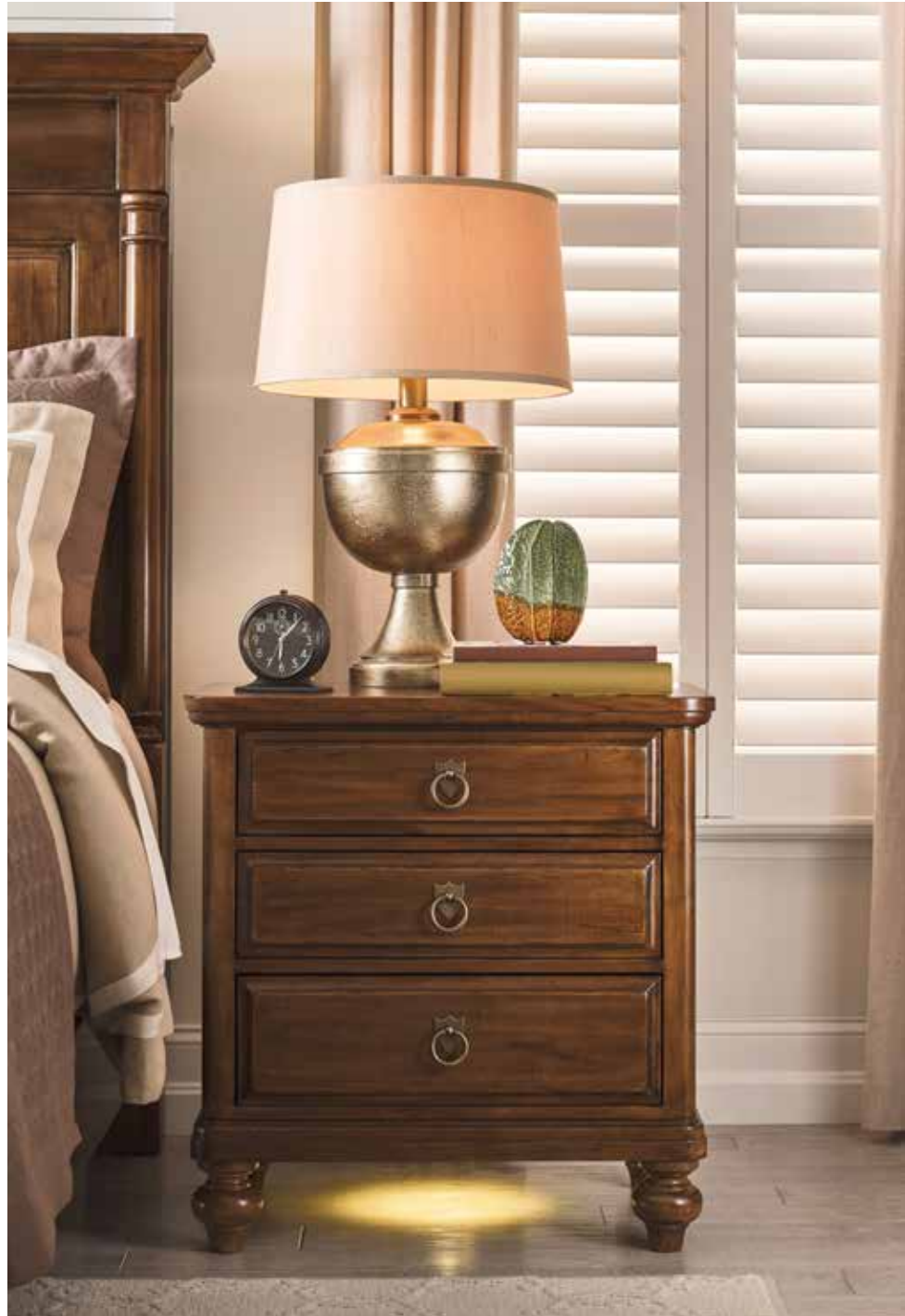
487-420 Harrison Nightstand night light on

Opposite Page | 487-420 Harrison Nightstand night light off