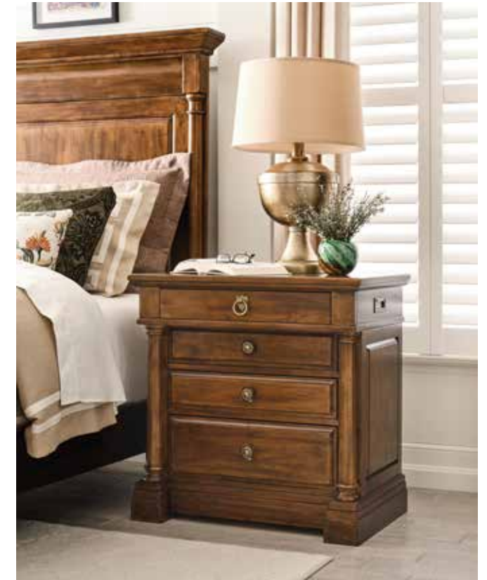
487-422 Bridgetown Bachelor's Chest