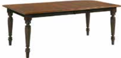
487-744B Nicholas Leg Table - Black W76 D42 H30 Adjustable levelers, two 20" leaves

Table Sizes: W76 D42 H30 - with no leaves W96 D42 H30 - with one leaf W116 D42 H30 - with one leaves Pages: 20/21, 26/27, 30/31