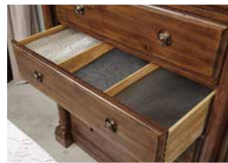
487-215 Bridgetown Chest drawer divider detail

Vintage style meets modern comfort in the Bridgetown collection