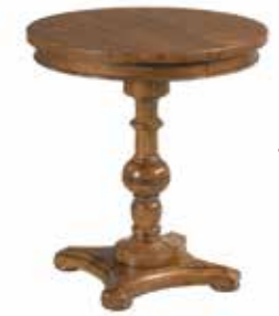
Table in high position (with extension block)