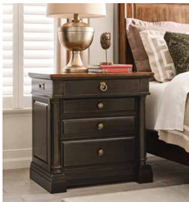
487-422B Bridgetown Bachelor's Chest