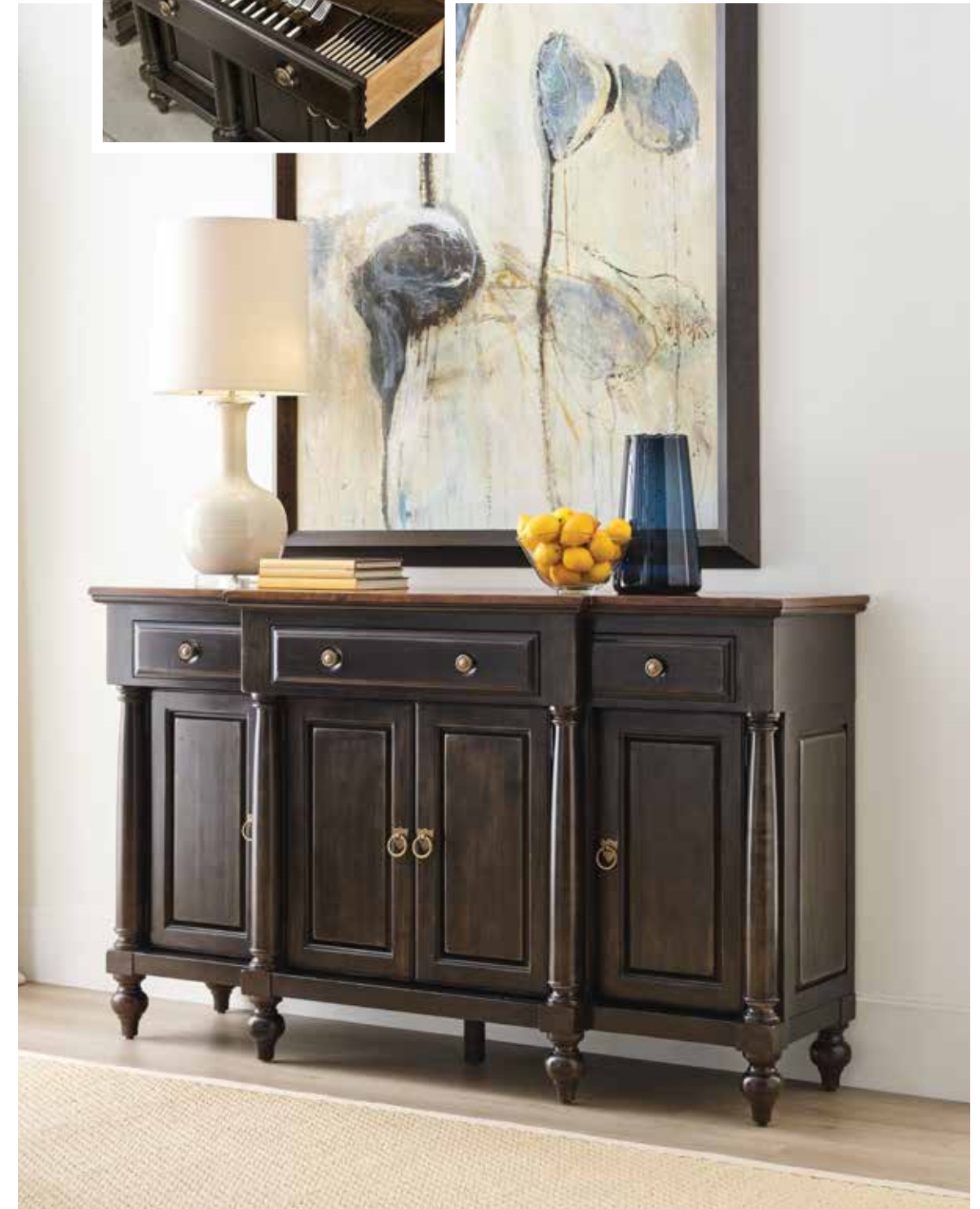
487-858B Harrison Credenza