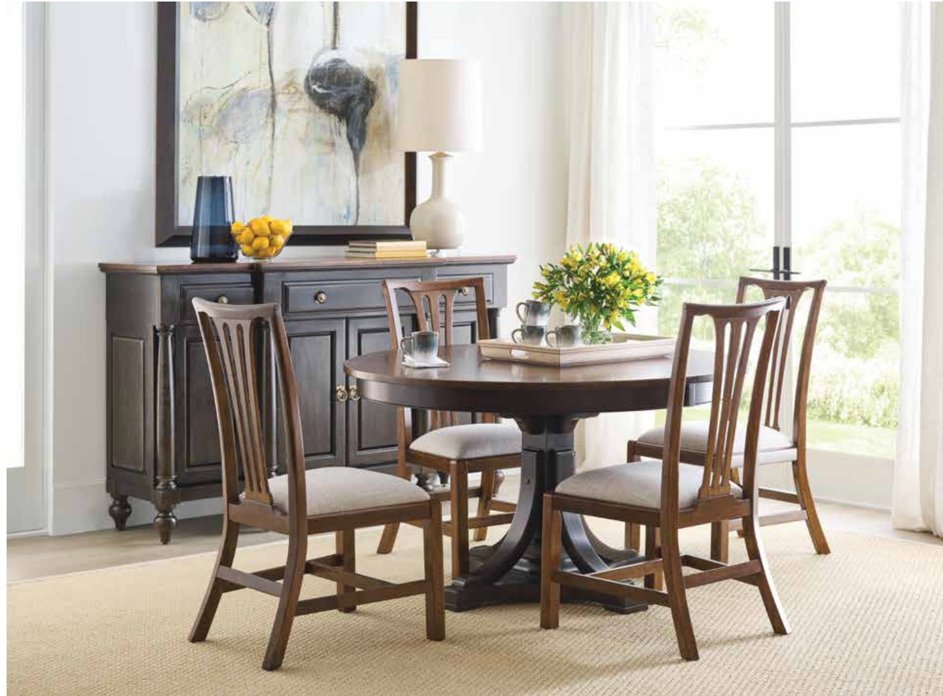
487-701P Broomefield Round Dining Table Package, 487-622 Fitts Side Chair, 487-858B Harrison Credenza