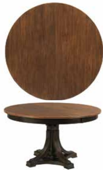
487-701BP Bromefield Round Dining Table Package - Black W54 D54 H30

Consists of: 487-701 Bromefield Round Dining Table Top W54 D54 H3-3/4