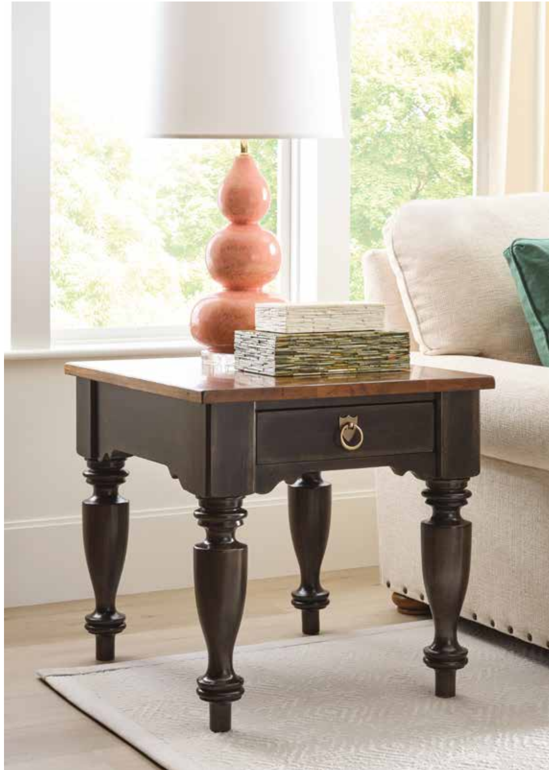
487-915B Kitridge End Table

Opposite Page | 487-916 Grantley Round End Table