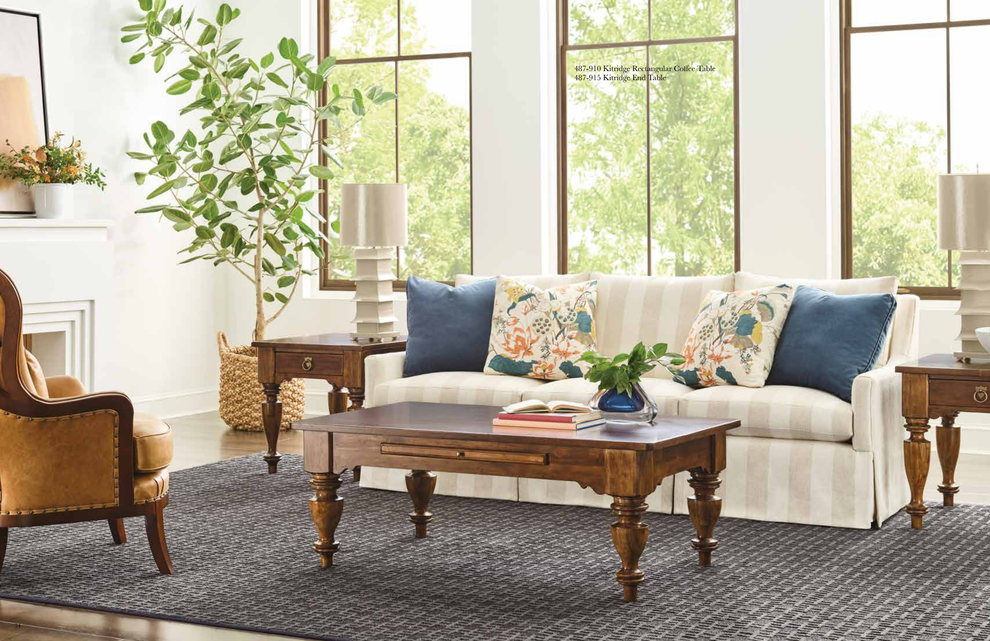
487-910 Kitridge Rectangular Coffee Table 487-915 Kitridge End Table