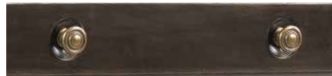
Bridgetown Black finish