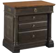
487-422B Bridgetown Bachelor's Chest W32 D20 H32 Four drawers, electric outlet on back of case, hidden storage area at bottom, adjustable levelers Pages 10/11