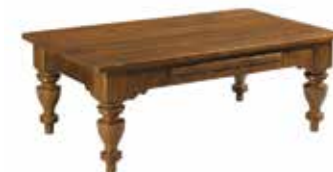
487-910 Kitridge Rectangular Coffee Table W54 D32 H20 Two pull-out laminate shelves, adjustable levelers Pages: 34/35