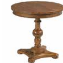
Table in low position