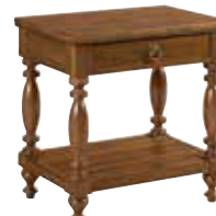
487-421 Warren Bedside Table W28 D19 H29 One drawer, slatted wood shelf, adjustable levelers Pages 14/15