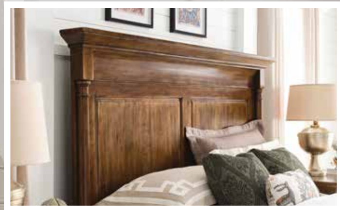
487-306P Kensington King Panel Bed Package headboard detail