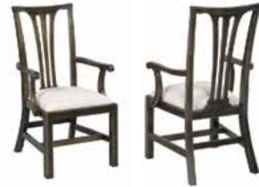
487-623B Fitts Arm Chair - Black W22-11/16 D23-1/2 H40 Upholstered seat and wood back Seat height: 19 Seat depth: 18 Seat depth: 25-5/8 Pages: 24/25, 29, 30/31