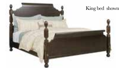
487-324BP Brighton Queen Poster Bed Package (5/0) W64-5/16 D93 H64

consists of: -324B Brighton Queen Poster Bed Headboard - 5/0 W64-5/16 D5-5/8 H64 -325B Brighton Queen Poster Bed Footboard with rails and slats - 5/0 W64-5/16 D5-3/8 H43