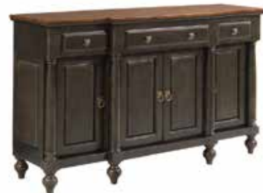
487-858B Harrison Credenza - Black W70 D21 H42 Three drawers, four doors, adjustable wood shelf behind two center doors, adjustable wood shelf behind each end door, three adjustable wood shelves total, brown felt liner in top drawers, adjustable levelers Pages: 20/21, 23, 24/25, 26/27, 30/31

Table Sizes: W76 D42 H30 - with no leaves W96 D42 H30 - with one leaf W116 D42 H30 - with one leaves Pages: 20/21, 26/27, 30/31