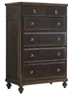
487-216B Harrison Drawer Chest - Black W40 D20 H58 Six drawers, adjustable levelers, Second and third drawers down from the top have drawer dividers. Pages 14/15, 17