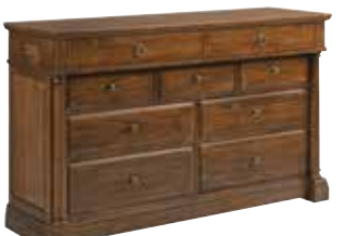
487-130 Bridgetown Dresser W68 D21 H42 Nine drawers, adjustable levelers, center foot, removable brown jewelry tray in top right drawer Pages 3, 4/5

Kincaid, in keeping with its tradition in crafting beautiful, high-quality, and durable furniture crafts its furniture collections using primarily solid woods and engineered natural wood materials selected for grain clarity, color coordination and design. As a natural material, wood can vary significantly in color, texture and grain pattern. Imperfections or variations in the grain, color, shading, and sheen, of the wood may occur naturally. As a result, any images or samples of our furniture are meant to be a representation only and are not intended to provide a perfect match to the actual product finish.