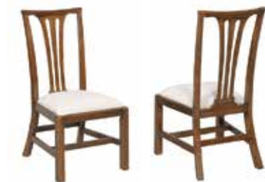
487-622 Fitts Side Chair W20-3/8 D23-1/2 H38 Upholstered seat and wood back Seat height: 18 Seat depth: 18 Pages: 19, 24/25, 29, 30/31