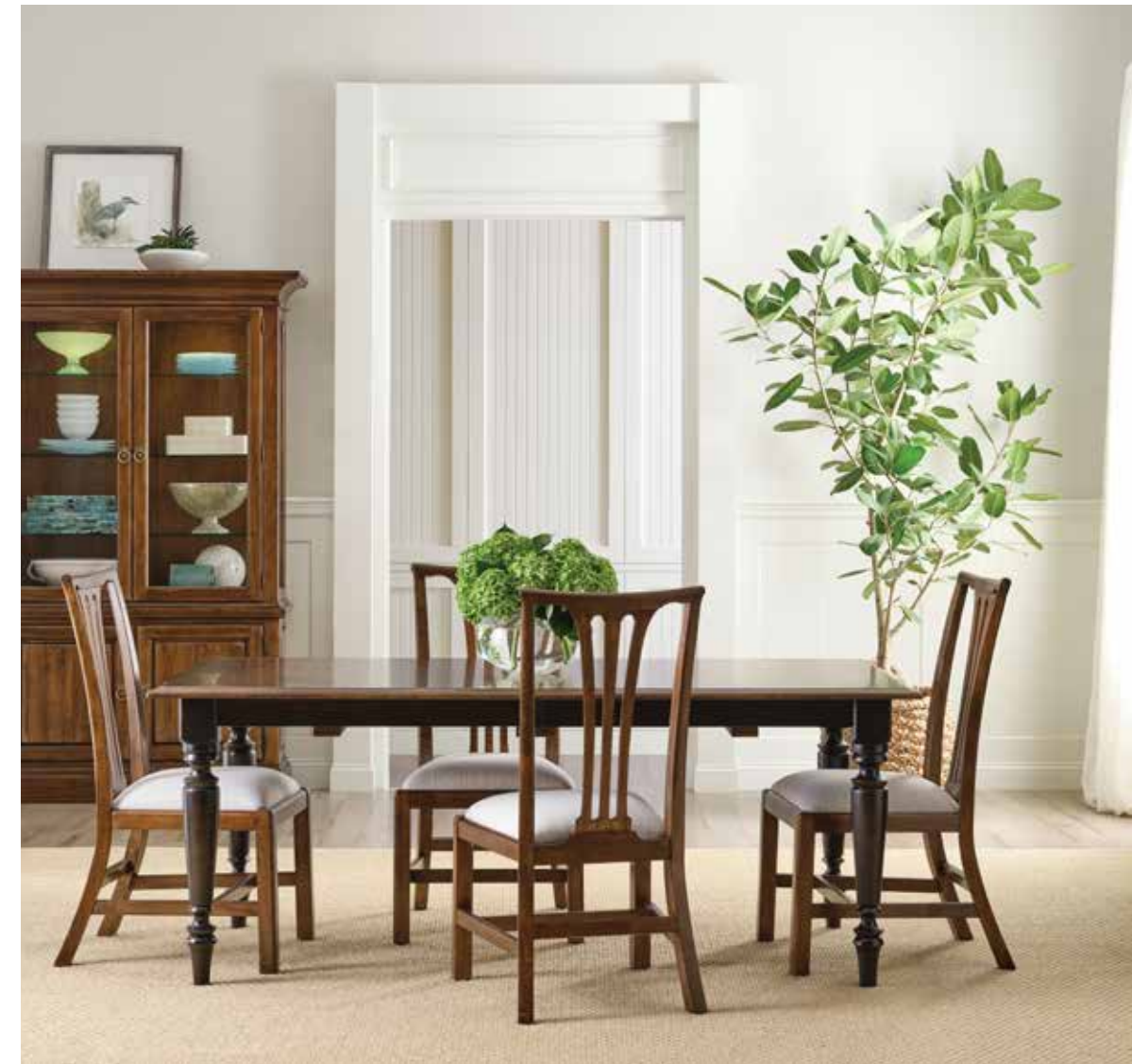
487-744B Nicholas Leg Table, 487-622 Fitts Side Chair, 487-830P Connell China