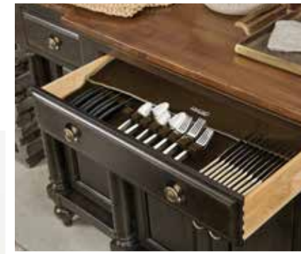
487-858B Harrison Credenza drawer detail