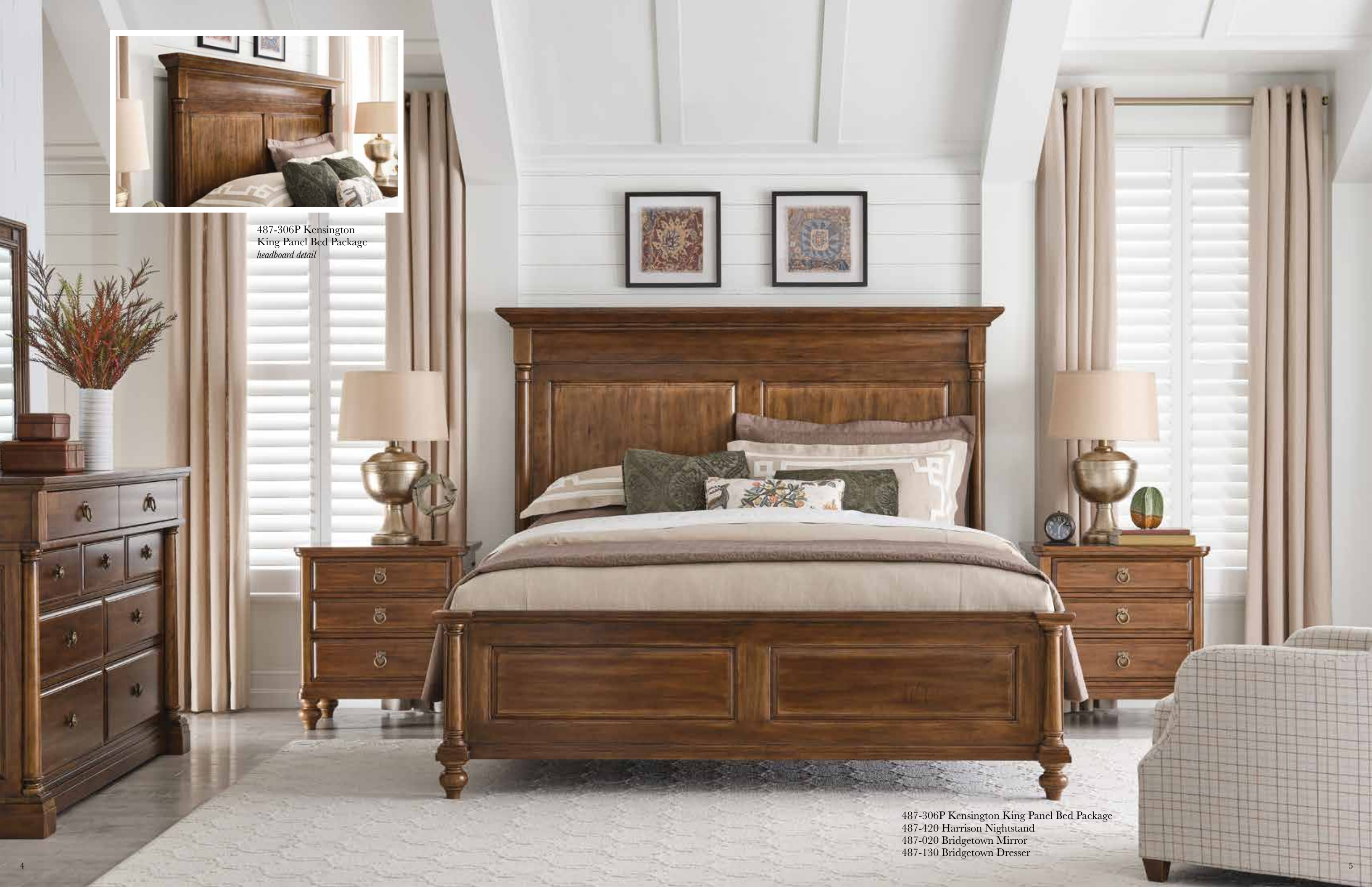
487-306P Kensington King Panel Bed Package 487-420 Harrison Nightstand 487-020 Bridgetown Mirror 487-130 Bridgetown Dresser