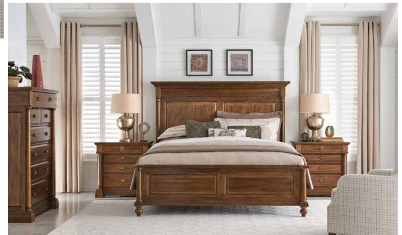
487-306P Kensington King Panel Bed Package 487-422B Bridgetown Bachelor's Chest 487-215 Bridgetown Chest