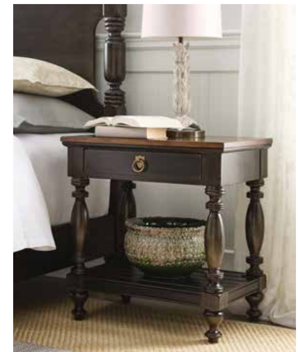
487-421B Warren Bedside Table night light on