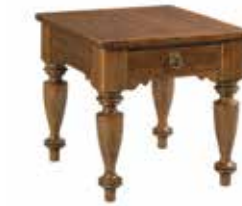
487-915 Kitridge End Table W25 D28 H25 One drawer, adjustable levelers Pages: 33, 34/35