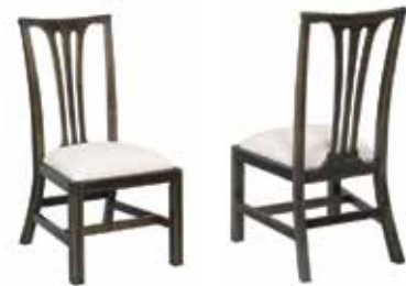
487-622B Fitts Side Chair - Black W20-3/8 D23-1/2 H38 Upholstered seat and wood back Seat height: 18 Seat depth: 18 Pages: 20/21, 26/27, 28