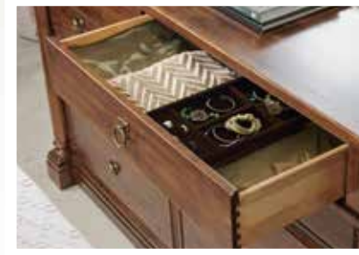
487-130 Bridgetown Dresser jewelry tray detail