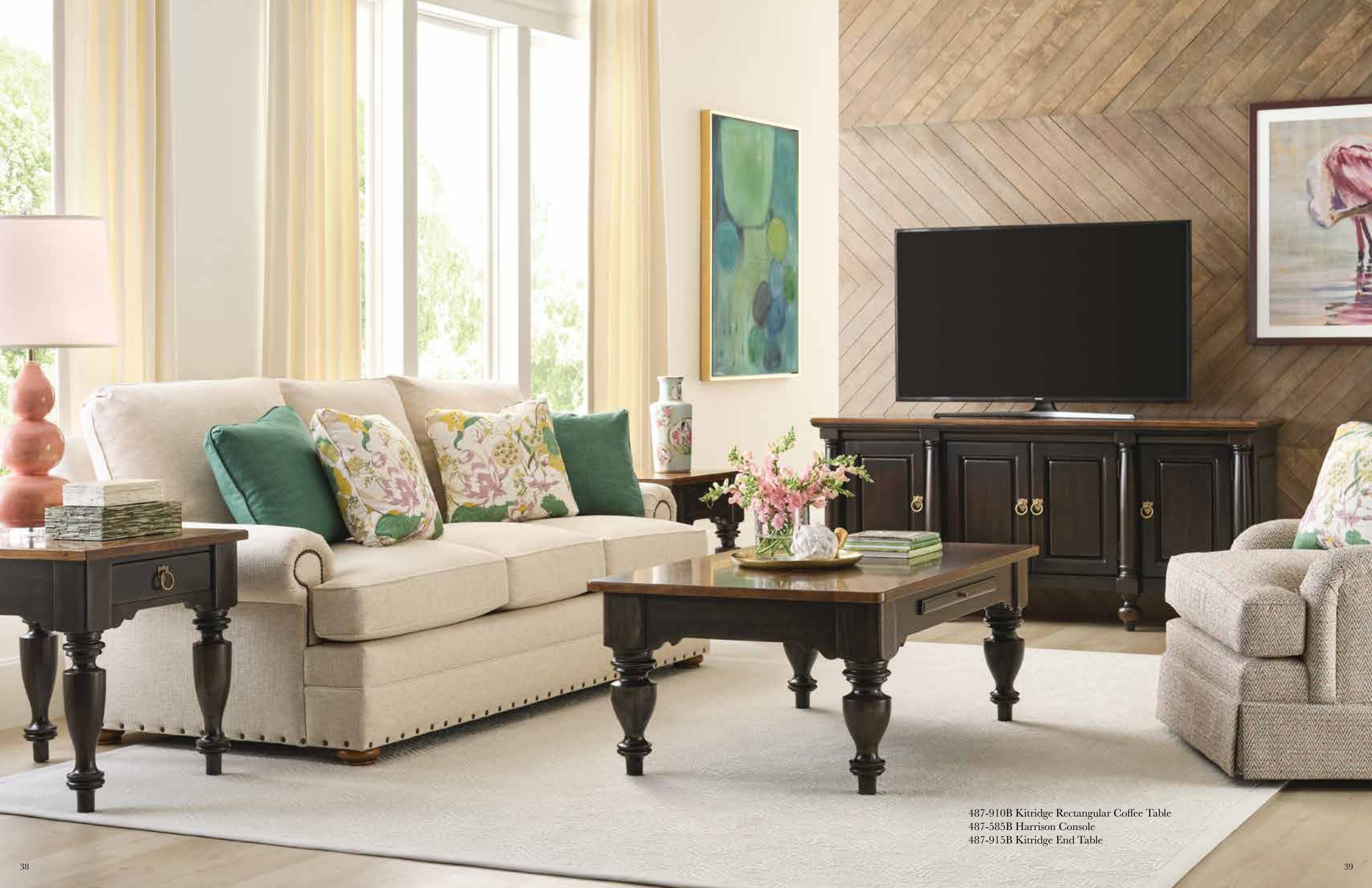
487-910B Kitridge Rectangular Coffee Table 487-585B Harrison Console 487-915B Kitridge End Table