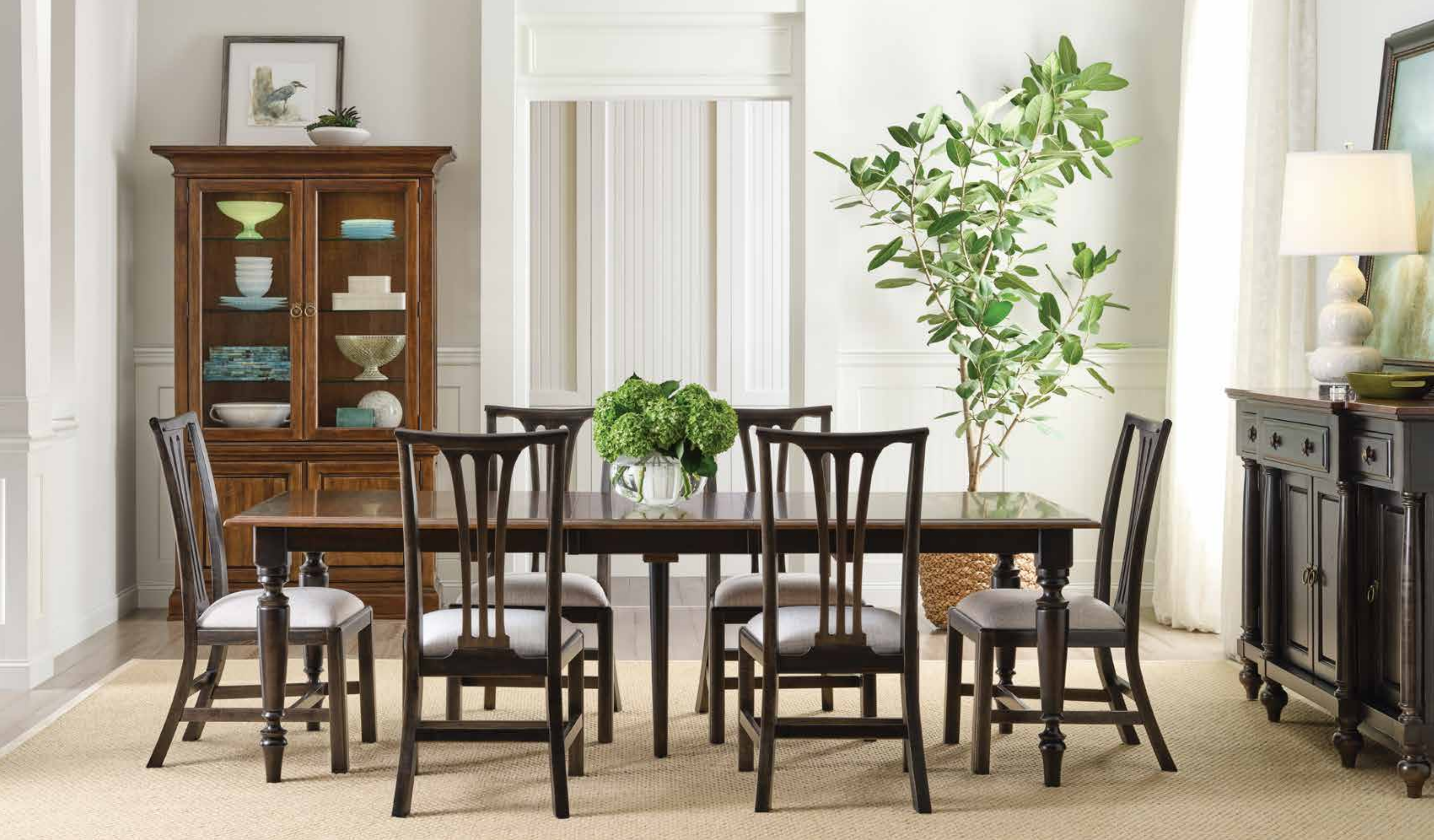
487-744B Nicholas Leg Table, 487-622B Fitts Side Chair, 487-830P Connell China, 487-858B Harrison Credenza