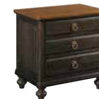
487-420B Harrison Nightstand W28 D18 H29 Three drawers, night light, electric outlet on back of case, adjustable levelers Pages 6/7

consists of: -326B Brighton King Poster Bed Headboard - 6/6 W80-5/16 D5-5/8 H64 -328B Brighton Cal-King Poster Bed Footboard with rails and slats - 6/0 W80-5/16 D5-3/8 H43