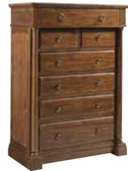
487-215 Bridgetown Chest W42 D21-1/2 H60 Seven drawers, adjustable levelers, third and fourth drawers down from the top have drawer dividers, hidden storage area at bottom Pages 10/11