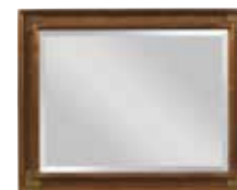
487-020 Bridgetown Mirror W44 D1-1/2 H35 Mirror hangers Pages 3, 4/5, 14/15

consists of: -306 Kensington King Panel Bed Headboard - 6/6 W84-3/4 D6 H68 -308 Kensington Cal-King Panel Bed Footboard with rails and slats - 6/0 W81-1/4 D4-1/4 H24