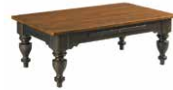
487-910B Kitridge Rectangular Coffee Table - Black W54 D32 H20 Two pull-out laminate shelves, adjustable levelers Pages: 38/39