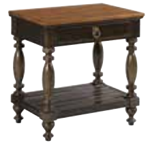
487-421B Warren Bedside Table W28 D19 H29 One drawer, slatted wood shelf, adjustable levelers Pages 12/13, 14/15