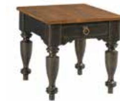
487-915B Kitridge End Table - Black W25 D28 H25 One drawer, adjustable levelers Pages: 36, 38/39