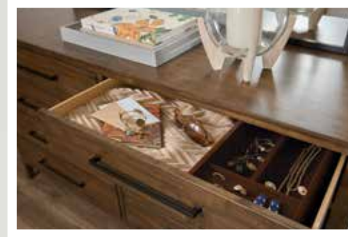
269-130 Larson Eight Drawer Dresser jewelry tray detail