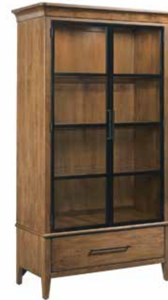
269-855P Gillian Display Cabinet W46-1/16 D21 H82 consists of: -855B Gillian Display Cabinet Base W43 D19-1/2 H18 One drawer, adjustable levelers. -855D Gillian Display Cabinet Deck W46-1/16 D21 H64 Two metal framed glass doors, three wood-framed adjustable glass shelves behind doors, one fixed wood shelf, two can lights, adjustable levelers Pages 19, 20