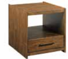
269-915 Edie Drawer End Table W24 D28 H26 One drawer, wood shelf, adjustable levelers drawer size: W21 D16 H4-1/4 Pages 30/31, 32/33, 35, 36/37