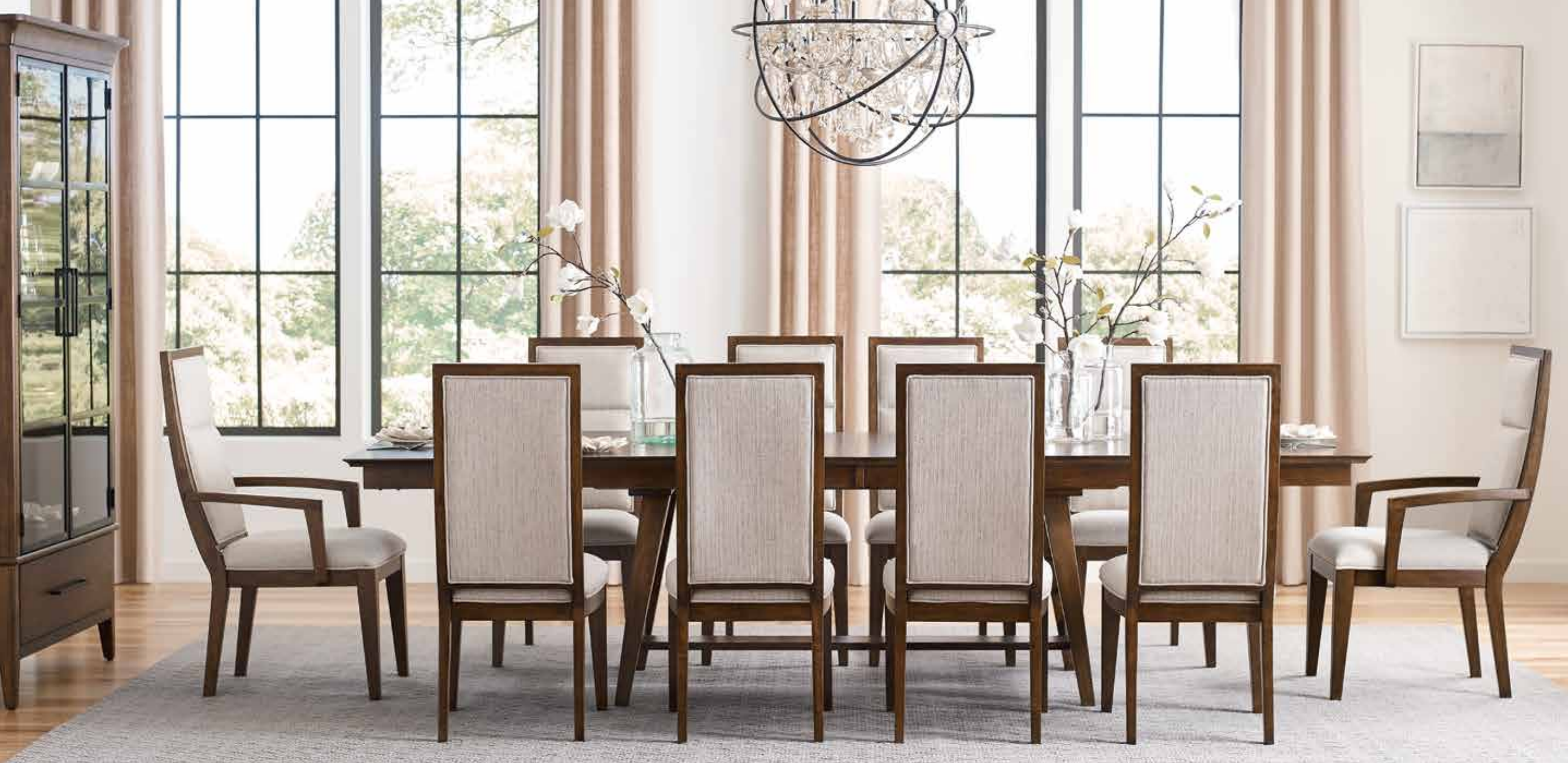
Left: 269-744 Zane Trestle Dining Table 269-636 Doyle Upholstered Side Chair 269-637 Doyle Upholstered Arm Chair 269-855P Gillian Display Cabinet