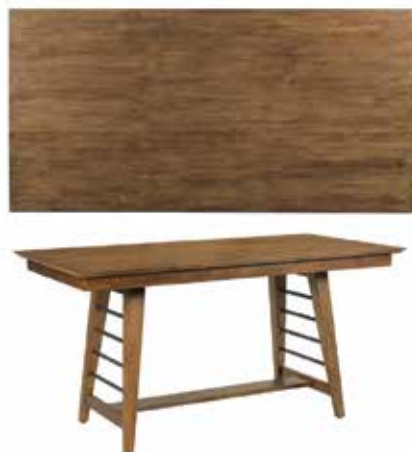
269-706 Zane Counter Height Trestle Table W72 D36 H36 Adjustable levelers Pages 26/27