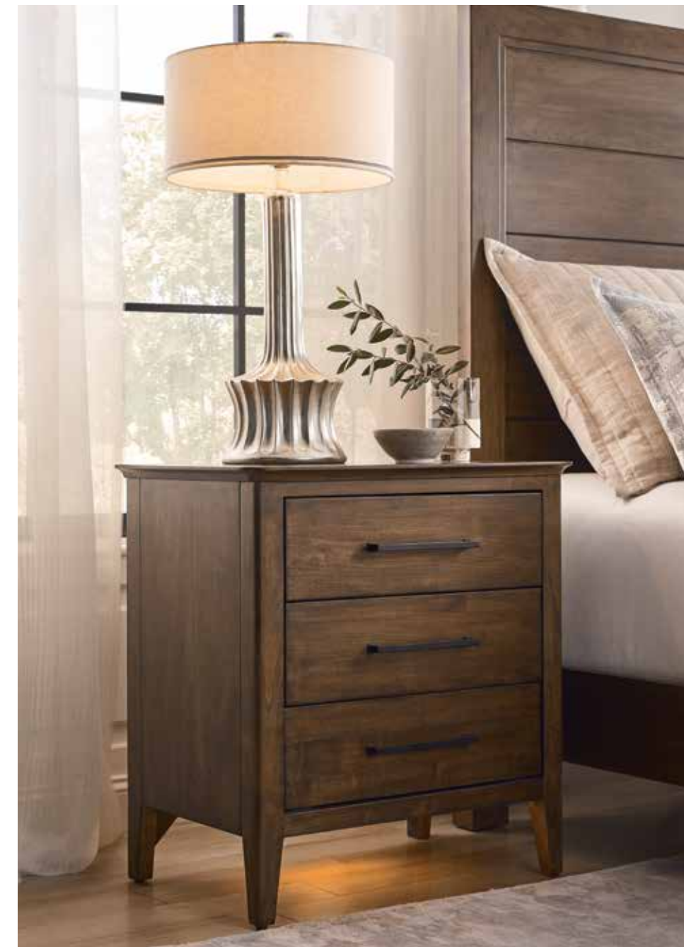
269-420 Larson Three Drawer Nightstand nightlight on