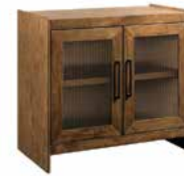
269-580 Wagner Two Door Cabinet W36 D20 H34 Two wood doors with reed glass, cord exits, one adjustable wood shelf behind doors, adjustable levelers, area behind doors without shelf: W34-1/2 D18-3/8 H25-1/4 Pages 32/33