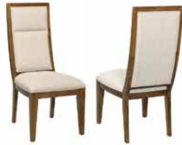
269-636 Doyle Upholstered Side Chair W19 D24-3/4 H42 Upholstered seat and back Seat height: 19 Seat depth: 18-1/2 Pages 16/17, 20/21, 22, 24/25