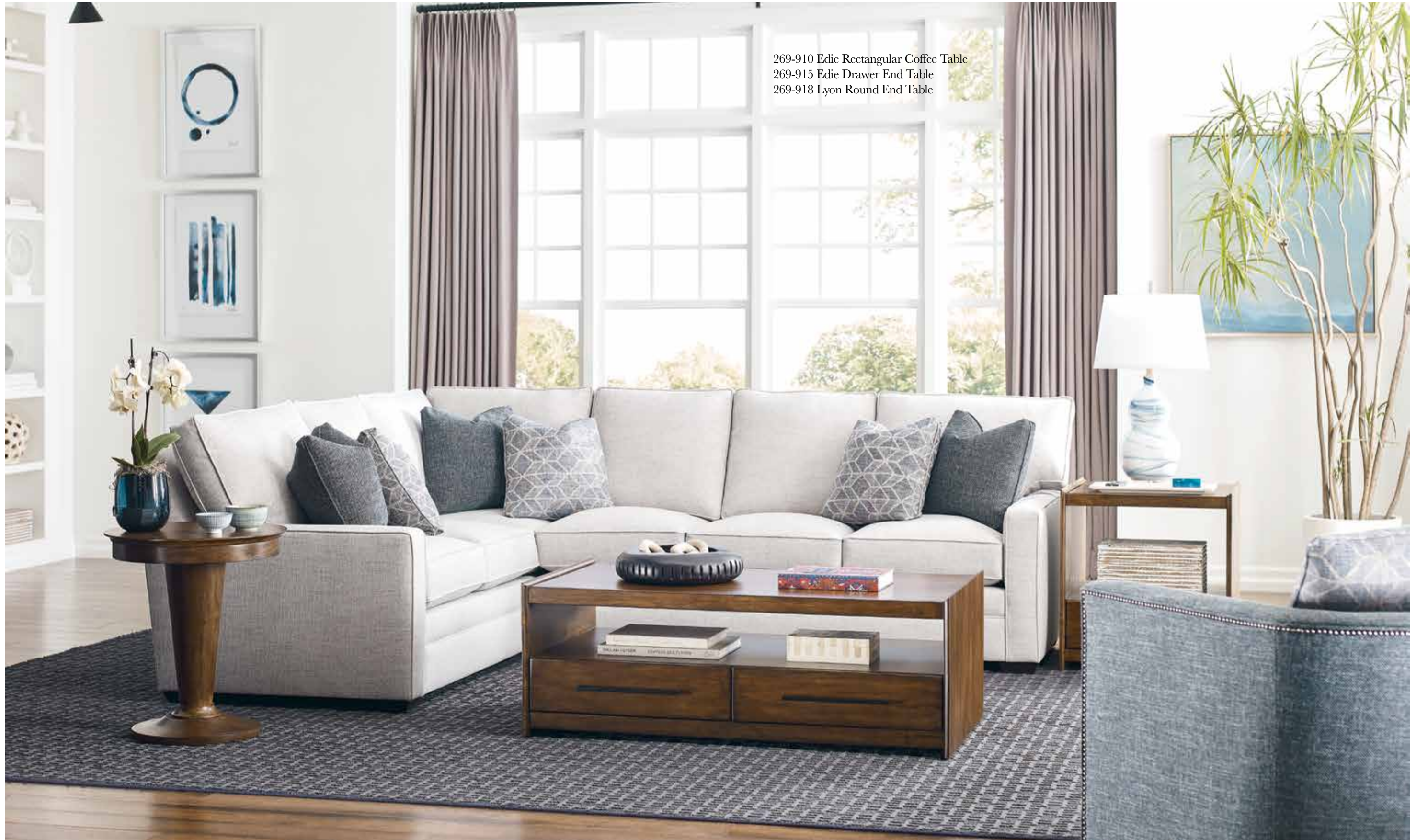
269-910 Edie Rectangular Coffee Table 269-915 Edie Drawer End Table 269-918 Lyon Round End Table