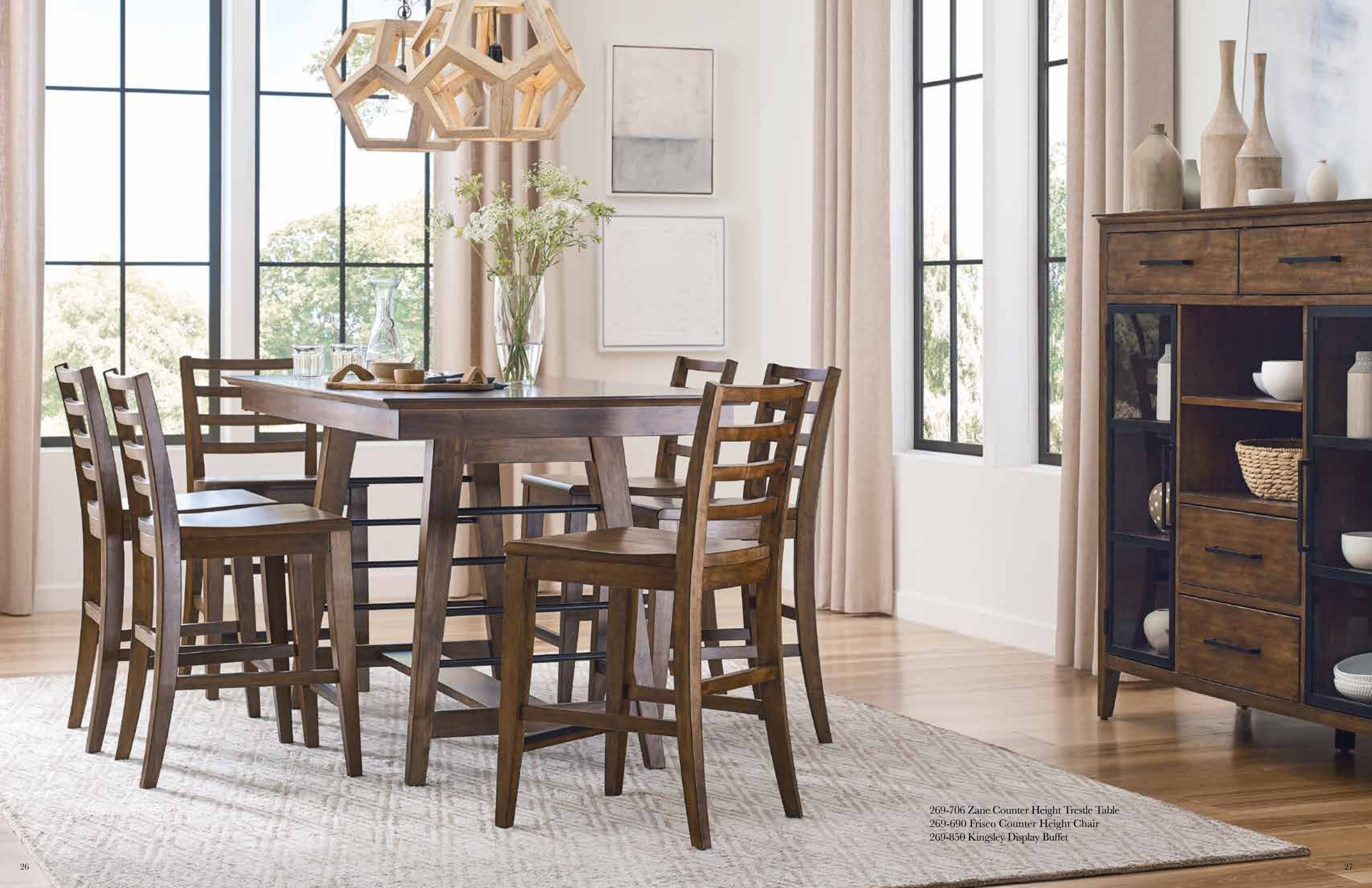
269-706 Zane Counter Height Trestle Table 269-690 Frisco Counter Height Chair 269-850 Kingsley Display Buffet