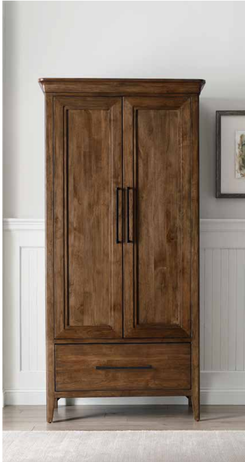
269-270 Kingsley Narrow Armoire