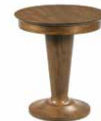
269-918 Lyon Round End Table W22 D22 H25 Pages 29, 30/31, 32/33, 36/37