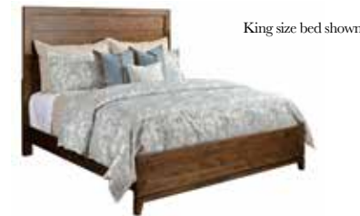
King size bed shown