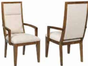
269-637 Doyle Upholstered Arm Chair W22 D24-3/4 H42 Upholstered seat and back Seat height: 19 Seat depth: 18-1/2 Arm height: 24-3/4 Pages 20/21, 22, 24/25