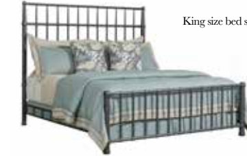
King size bed shown