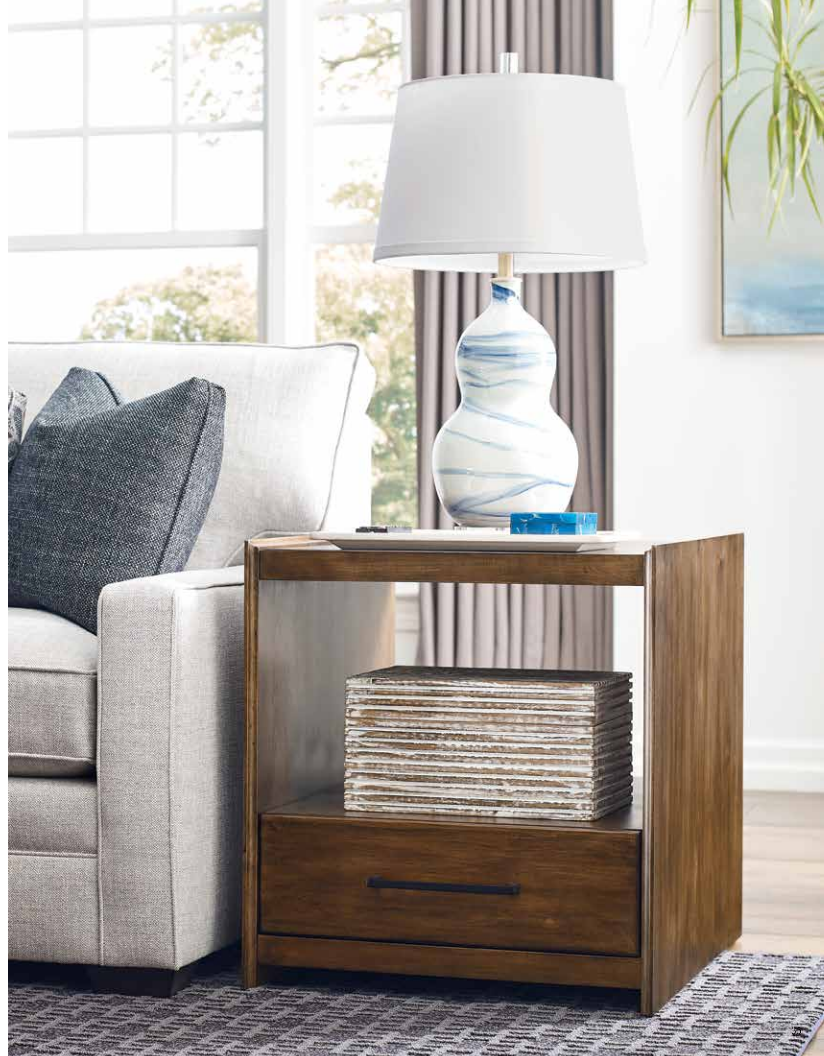
Opposite Page | 269-915 Edie Drawer End Table