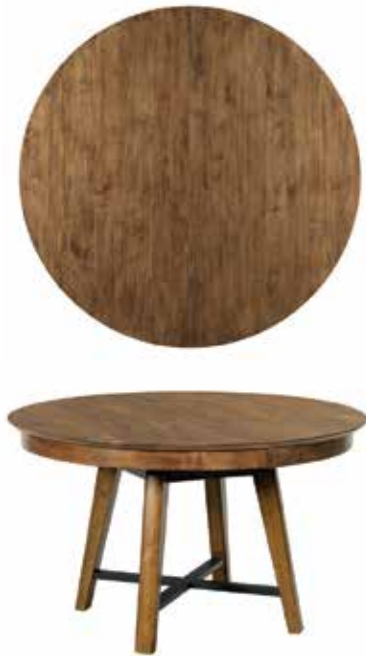
269-701P Salter Round Dining Table W50 D50 H30 consists of: -701 Salter Round Dining Top W50 D50 H2-3/4 -B01 Salter Dining Base W34 D34 H27-1/4 Adjustable levelers, one 20 inch leaf Table Sizes: W50 D50 H30 (with no leaf) W70 D50 H30 (with one leaf) Pages 16/17,