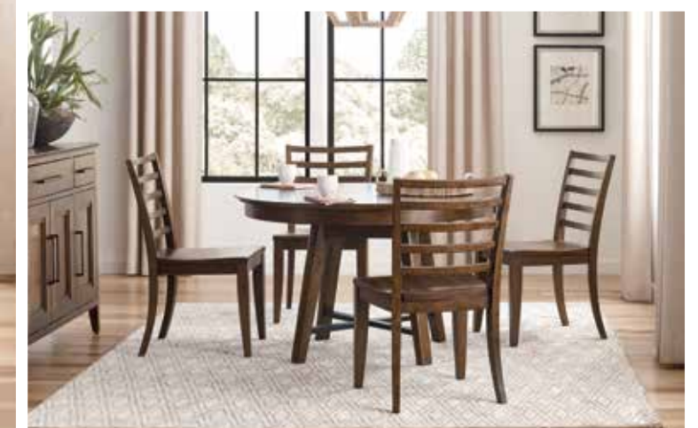
269-701P Salter Round Dining Table 269-857 Larson Four Door Buffet 269-638 Frisco Ladderback Side Chair