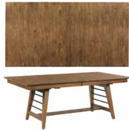
269-744 Zane Trestle Dining Table W80 D42 H30 Adjustable levelers, two 20" leaves Table Sizes: W80 D42 H30 (with no leaf) W100 D42 H30 (with one leaf) W120 D42 H30 (with two leaves) Pages 20/21, 24/25