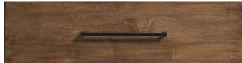
Warm Brunette finish

Kincaid’s dovetail drawer construction (front & back) uses the very best dovetail for each application.