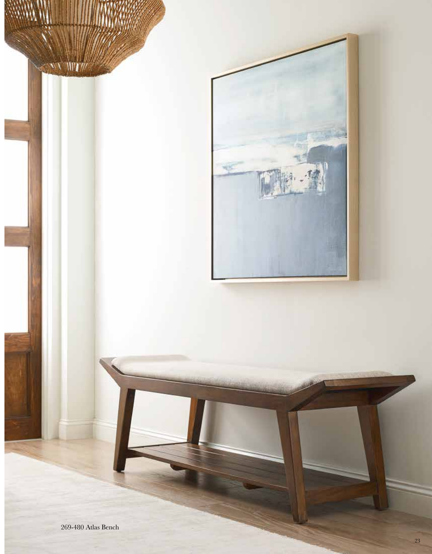
269-480 Atlas Bench