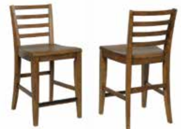
269-690 Frisco Counter Height Chair W19 D20-3/8 H38 Wood seat and back Seat height: 24-1/2 Seat depth: 18 Pages 26/27