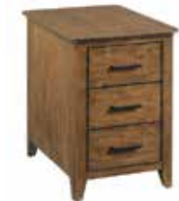
269-916 Larson Chairside Table W18 D25 H25 Three drawers, flip down door in back with a two outlet plug and usb port, adjustable levelers drawer size: W10-5/8 D16 H3-3/4 Page 30/31, 32/33, 34