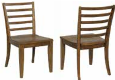
269-638 Frisco Ladderback Side Chair W19-3/4 D22-1/2 H36 Wood seat and back Seat height: 18-1/2 Seat depth: 18-1/2 Pages 17, 20/21, 22