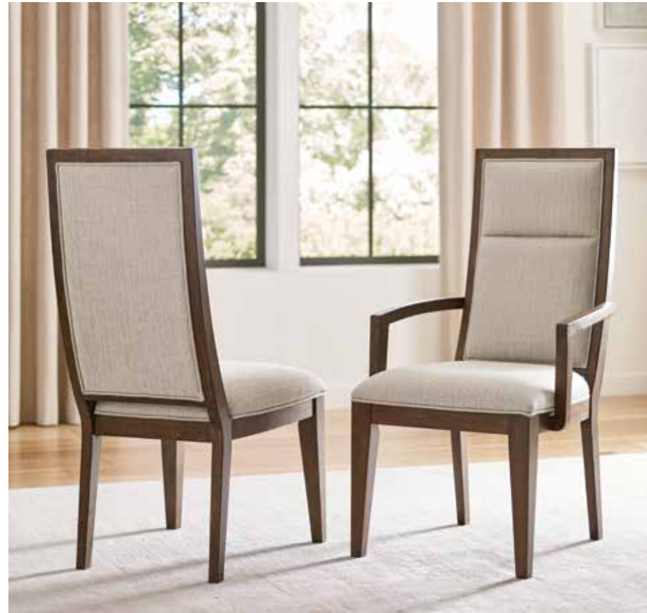
269-636 Doyle Upholstered Side Chair, 269-637 Doyle Upholstered Arm Chair