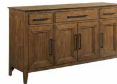
269-857 Larson Four Door Buffet W66 D20 H38 Four doors, three drawers, one adjustable wood shelf behind each end door, one adjustable wood shelf behind two center doors, three wood shelves total, removable brown silverware tray in center drawer, center foot. Pages 17, 18, 21, 24/25