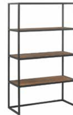
269-581 Wagner Metal Hutch W34 D15 H58-1/8 Three wood shelves. Pages 32/33