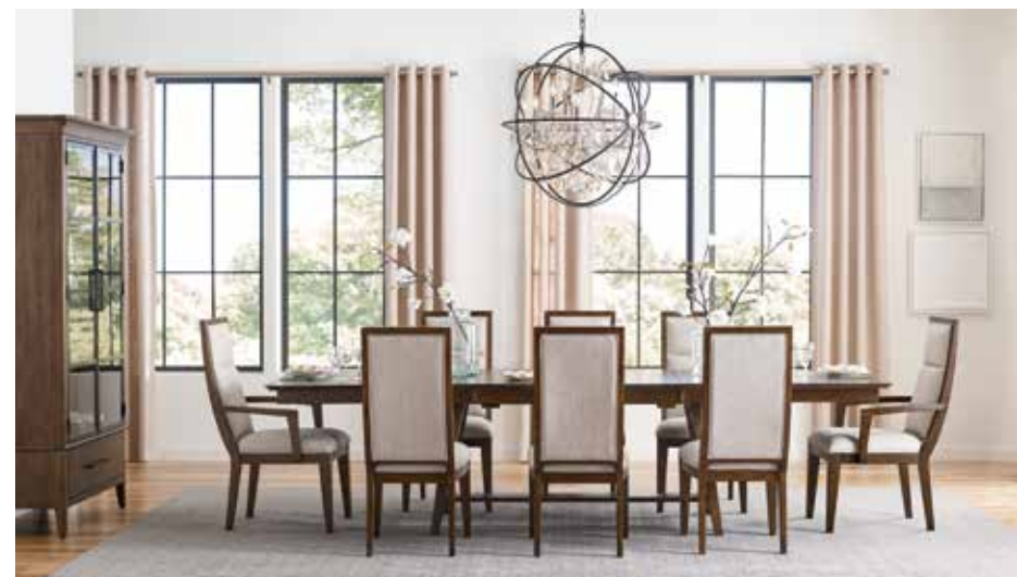
269-744 Zane Trestle Dining Table, 269-636 Doyle Upholstered Side Chair 269-637 Doyle Upholstered Arm Chair, 269-855P Gillian Display Cabinet