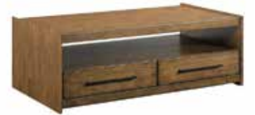
269-910 Edie Rectangular Coffee Table W52 D28 H19 Two drawers, casters, wood shelf drawer size: 23-1/4 D16 H4-1/4 Pages 30/31, 32/33, 36/37