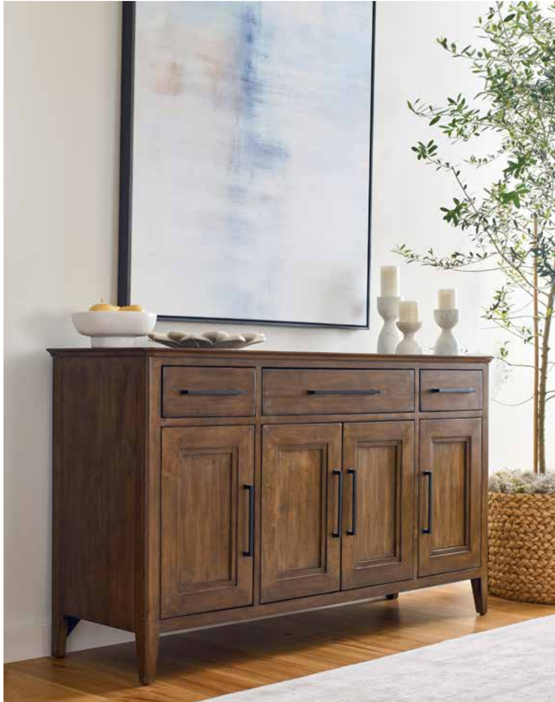
269-857 Larson Four Door Buffet