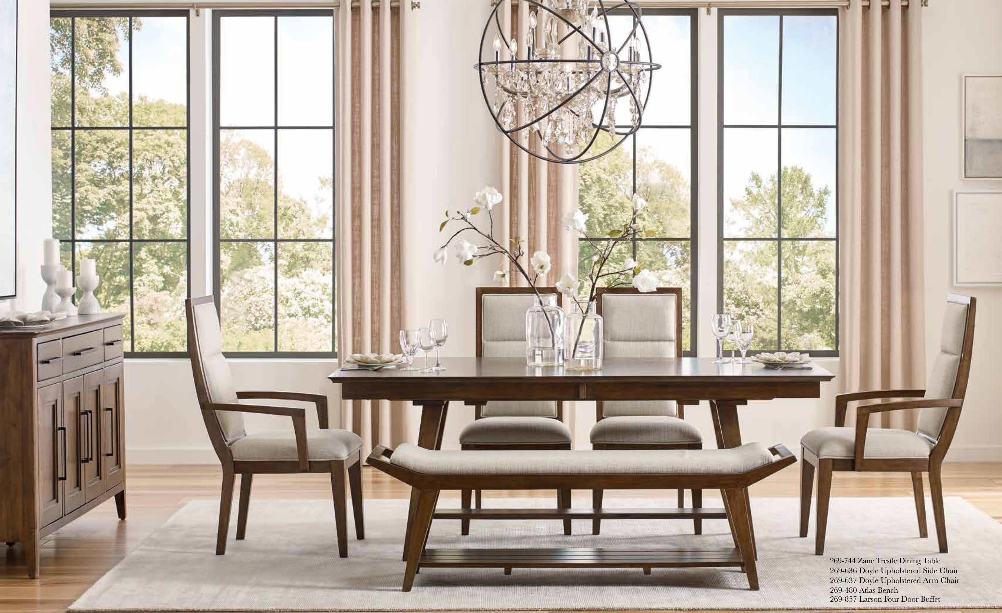
269-744 Zane Trestle Dining Table 269-636 Doyle Upholstered Side Chair 269-637 Doyle Upholstered Arm Chair 269-480 Atlas Bench 269-857 Larson Four Door Buffet