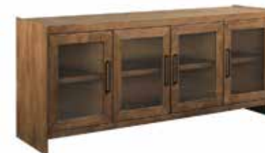
269-585 Wagner Four Door Console W76 D20 H34 Four wood framed doors with reed glass, electric outlet for three plugs behind center doors, cord exits, center foot, adjustable levelers Area behind center doors without shelf: W37-1/4 D15-5/8 H25-1/2 Area behind end doors without shelf: W17 3/4 D15-5/8 H25-1/2 Pages 32/33