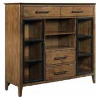
269-850 Kingsley Display Buffet W58 D20 H54 Two metal doors, four drawers, two adjustable wood shelves behind each door, five adjustable wood shelves total, one fixed wood shelf, removable brown silverware tray in right drawer, hand holds in back of case, adjustable levelers. Pages 15, 16/17, 26/27