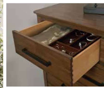
269-131 Larson Tall Eleven Drawer Dresser (jewelry tray detail)