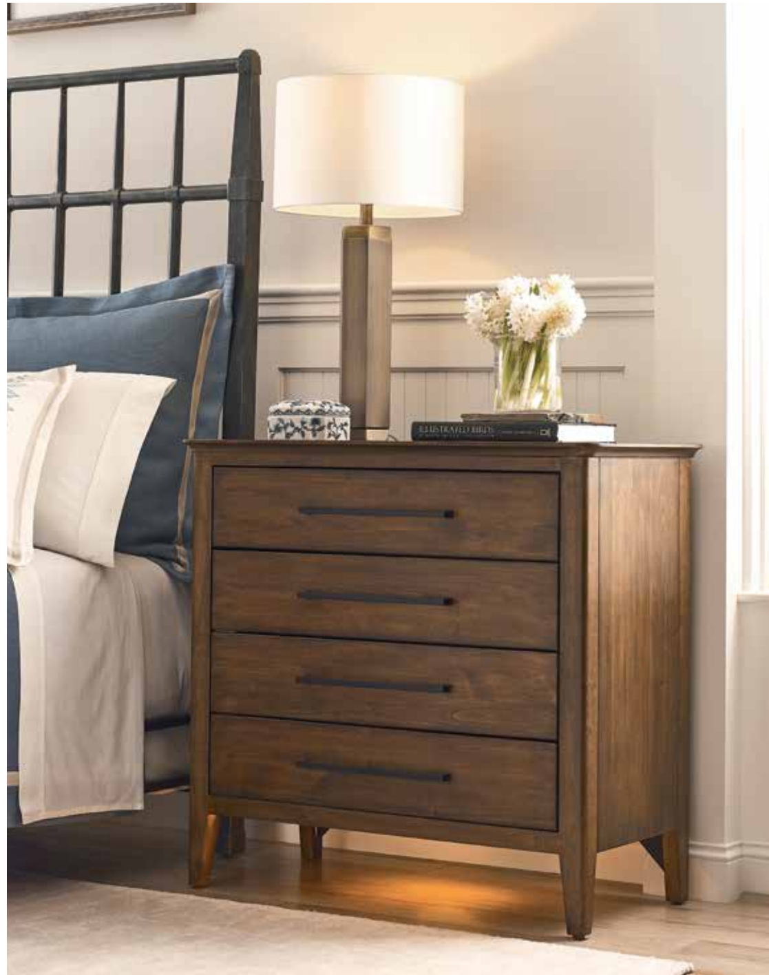
269-422 Kingsley Bachelor's Chest nightlight on