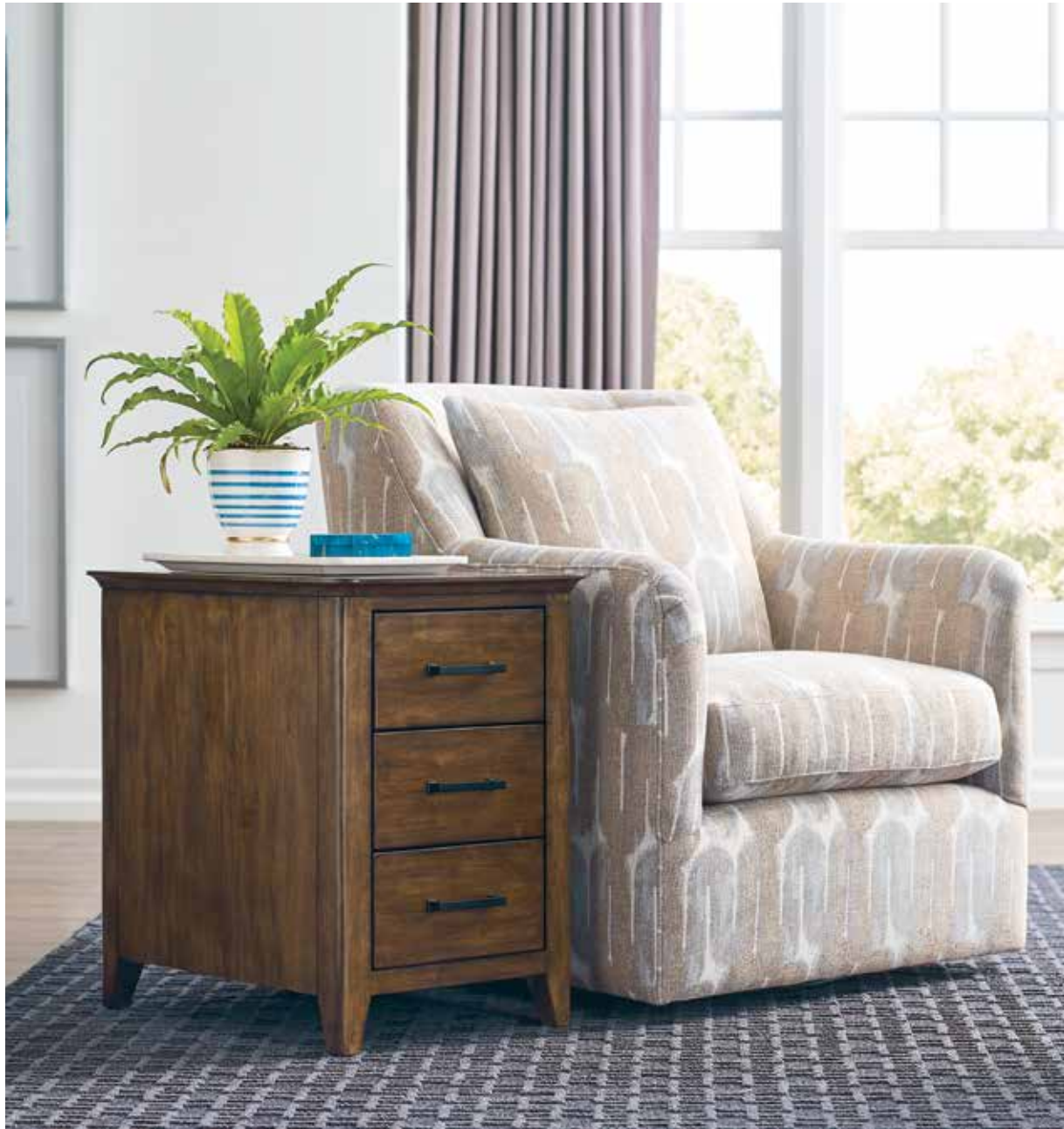
269-916 Larson Chairside Table