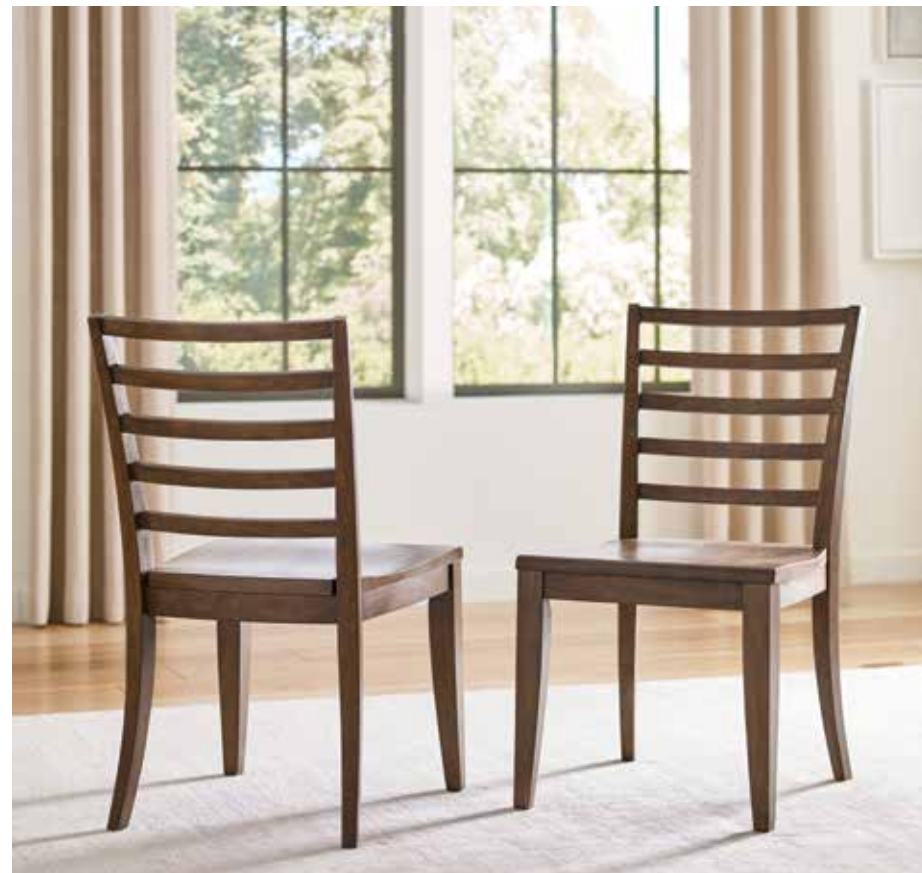
269-638 Frisco Ladderback Side Chair