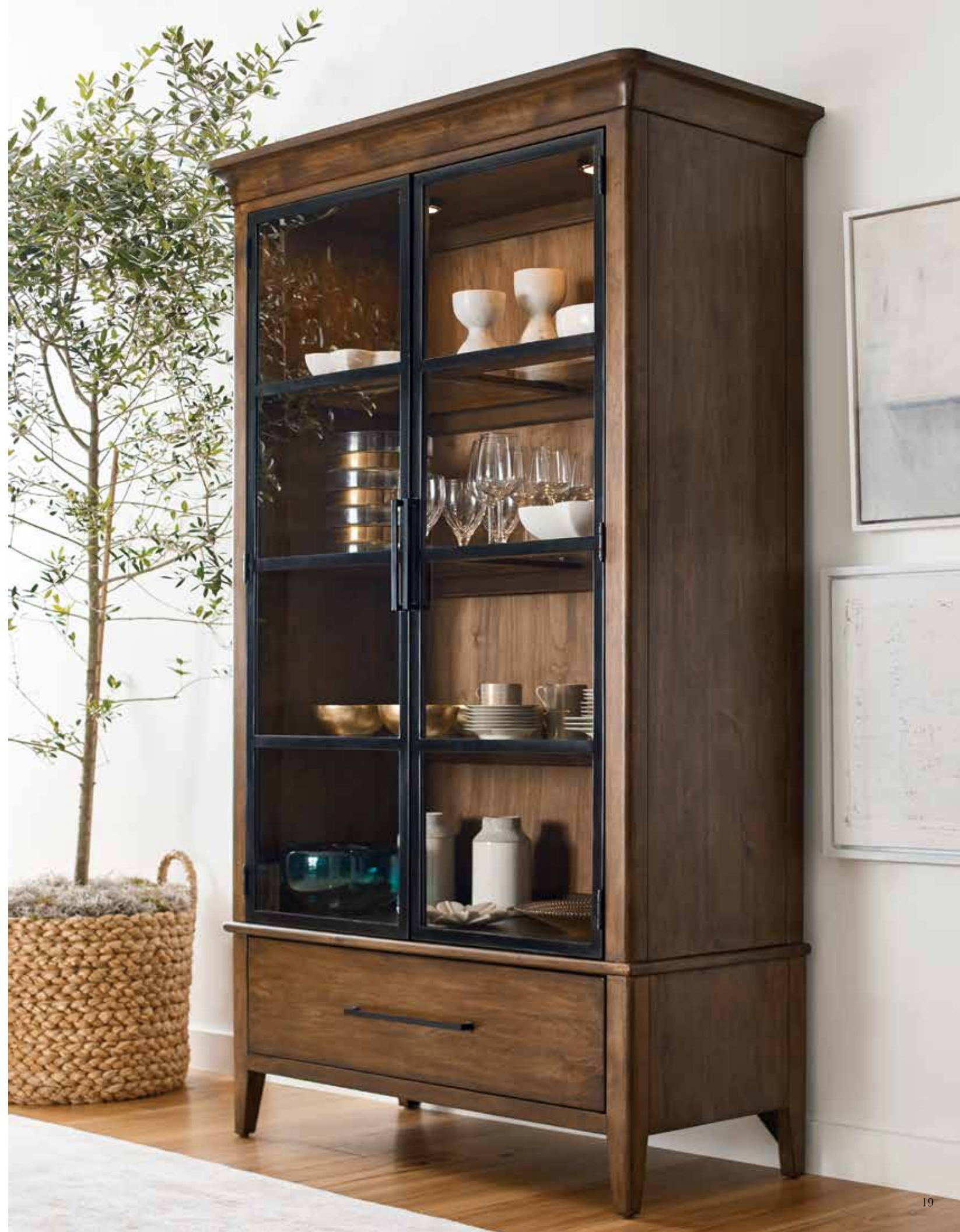
Opposite Page | 269-855P Gillian Display Cabinet