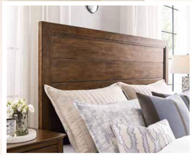
269-306P Schafer King Panel Bed - Complete (headboard detail)