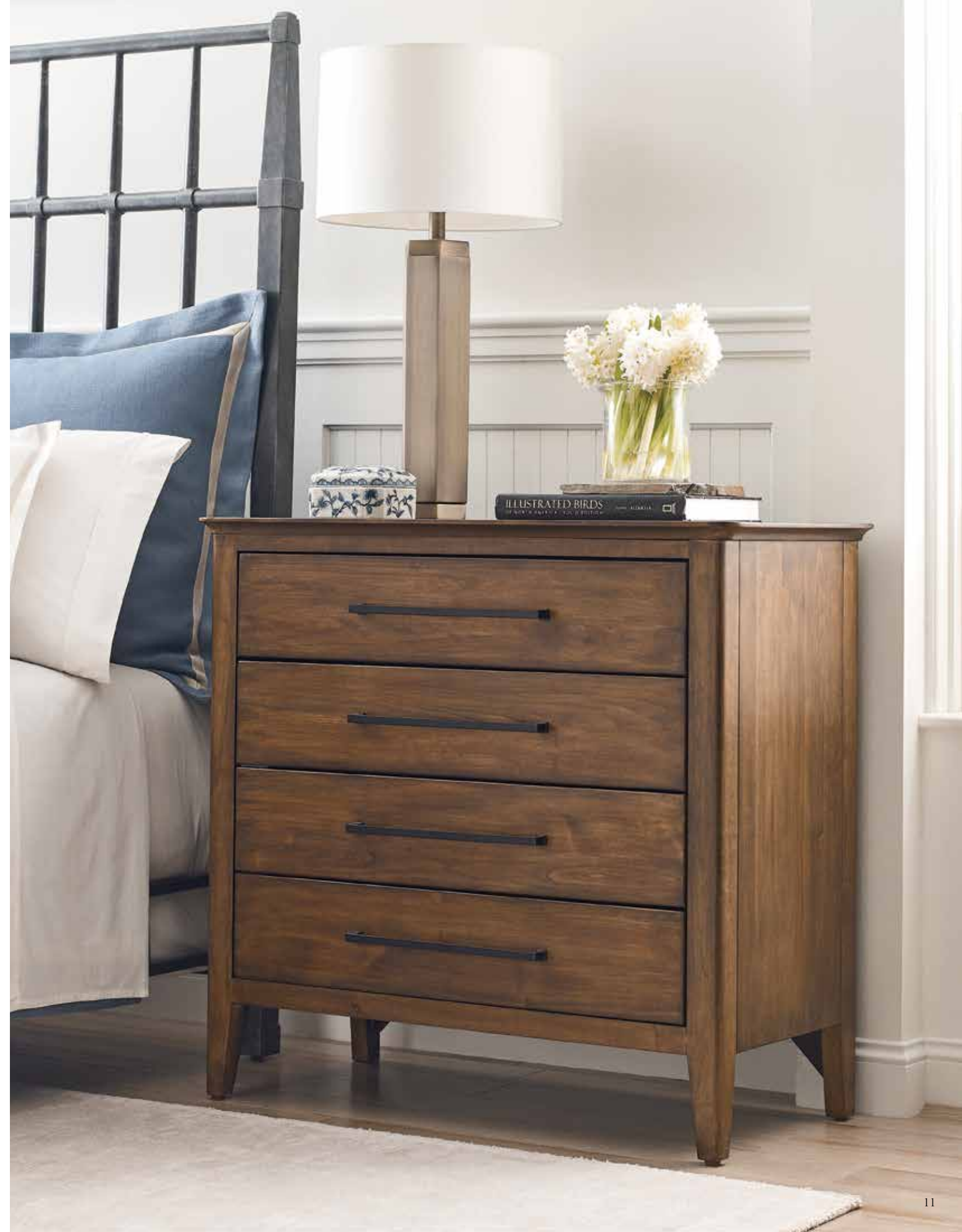
Opposite Page | 269-422 Kingsley Bachelor's Chest nightlight off