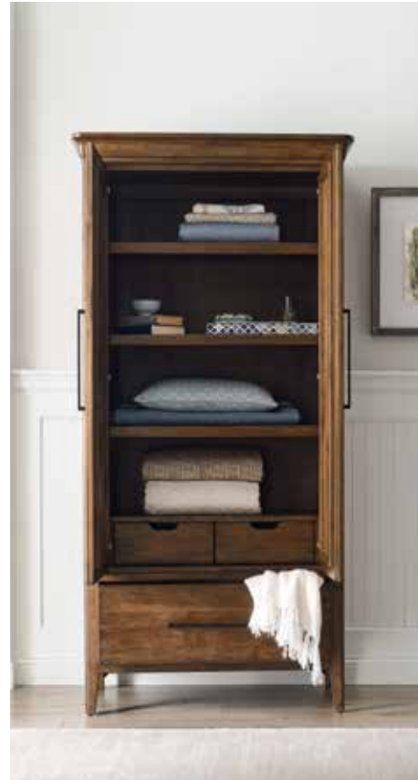
269-270 Kingsley Narrow Armoire inside detail