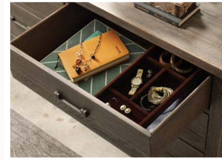
012-130 LOWELL SIX DRAWER DRESSER jewelry tray detail