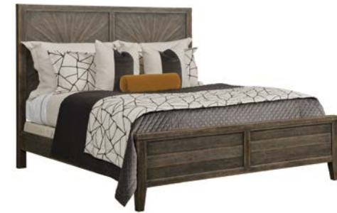
012-306R CHESWICK KING PANEL BED - COMPLETE 6/6 W80¼ D86¾ H62 Consists of: -306 CHESWICK KING PANEL BED HEADBOARD W80¼ D2 H62 -307 CHESWICK KING PANEL BED FOOTBOARD 5/0 W80¼ D2¾ H22 -R42 BOLT ON RAILS 5/0-6/6 W82 D2 H7 pages: 4/5, 6