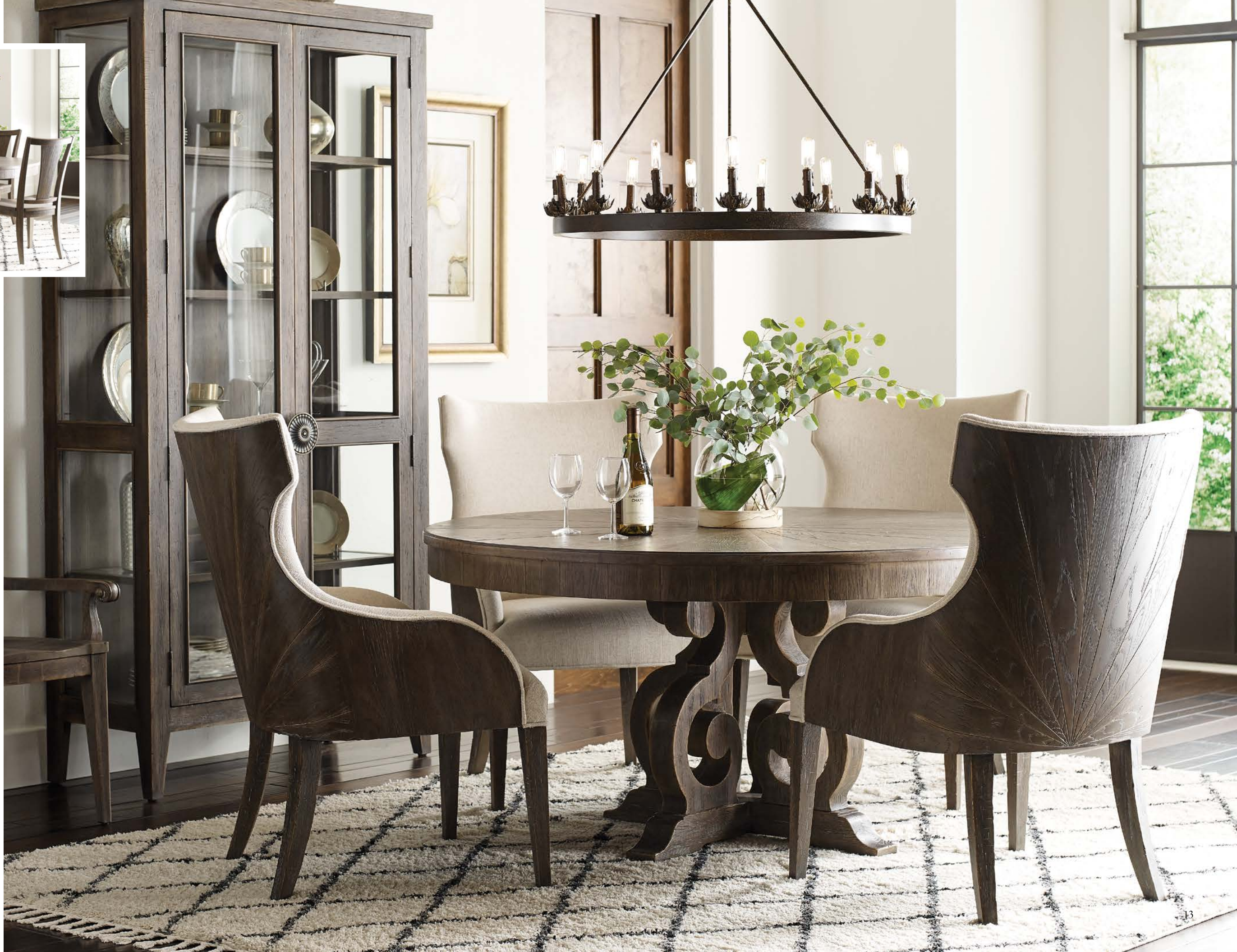
012-701R ELLSWORTH ROUND DINING TABLE 012-855 ACKERLY CURIO CABINET 012-622 ARMSTRONG UPHOLSTERED DINING HOST CHAIR