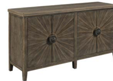
012-850 KISTLER BUFFET

W64 D19 H36 Two adjustable wood shelves, two interior drawers, four doors, adjustable levelers, adjustable wood shelf behind each set of doors, shelf size: W29 D16 drawer size: W21 D12 H3⅞ area behind doors without shelves: W29½ D17 H21½ pages: 15, 16/17