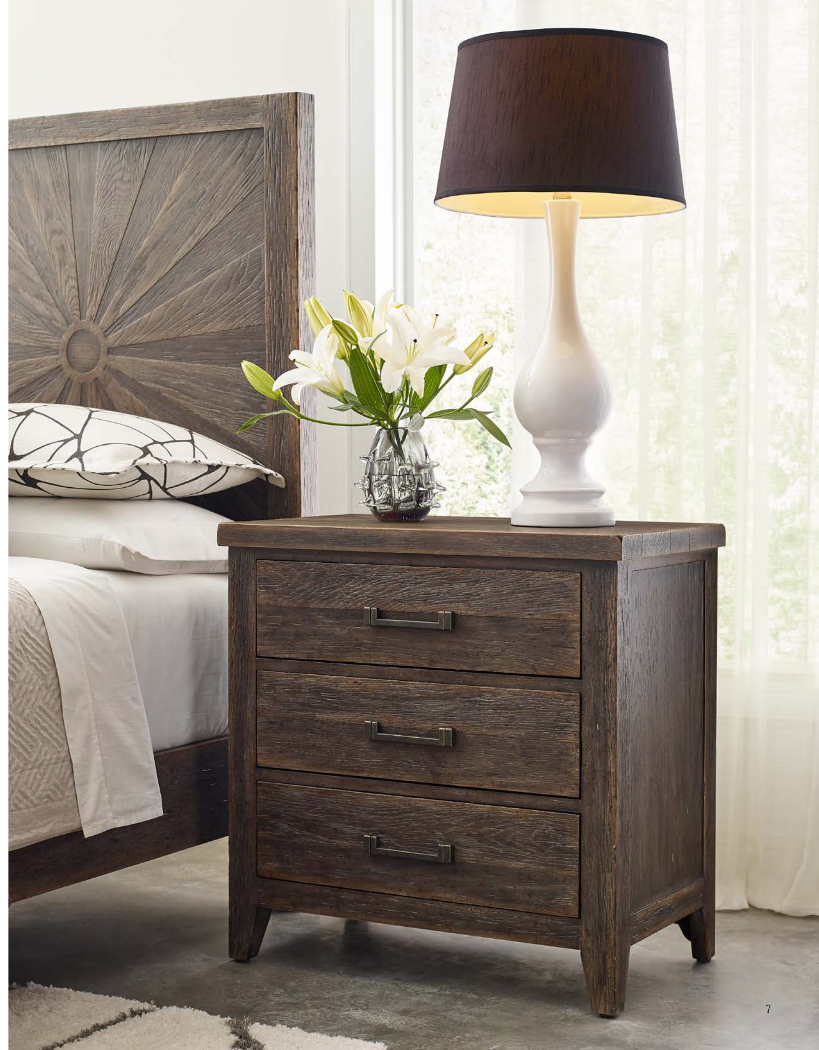
RIGHT: 012-420 PARKER NIGHTSTAND