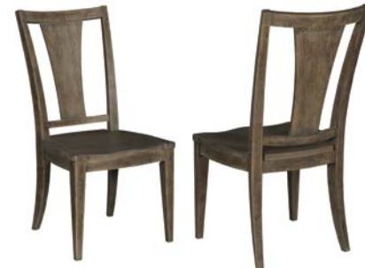
012-636 MONTGOMERY SIDE CHAIR

Three drawers, adjustable levelers, bottom drawer is Cedar lined, recessed area in back with a two plug outlet and usb port pages: 4/5, 7, 9