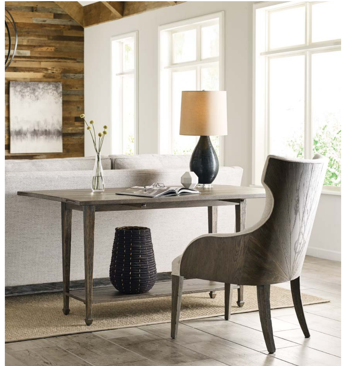
012-925 VALERIE SOFA TABLE