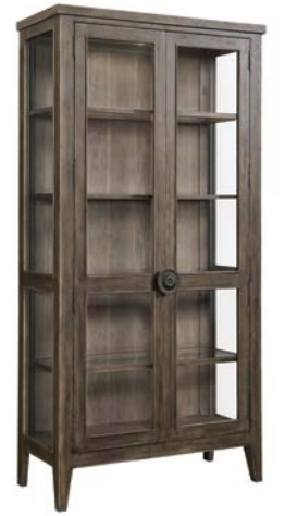
012-855 ACKERLY CURIO CABINET

W88 D42 H30 - without leaves W108 D42 H30 - with one 20 inch leaf W128 D42 H30 - with two 20 inch leaves pages: 16/17