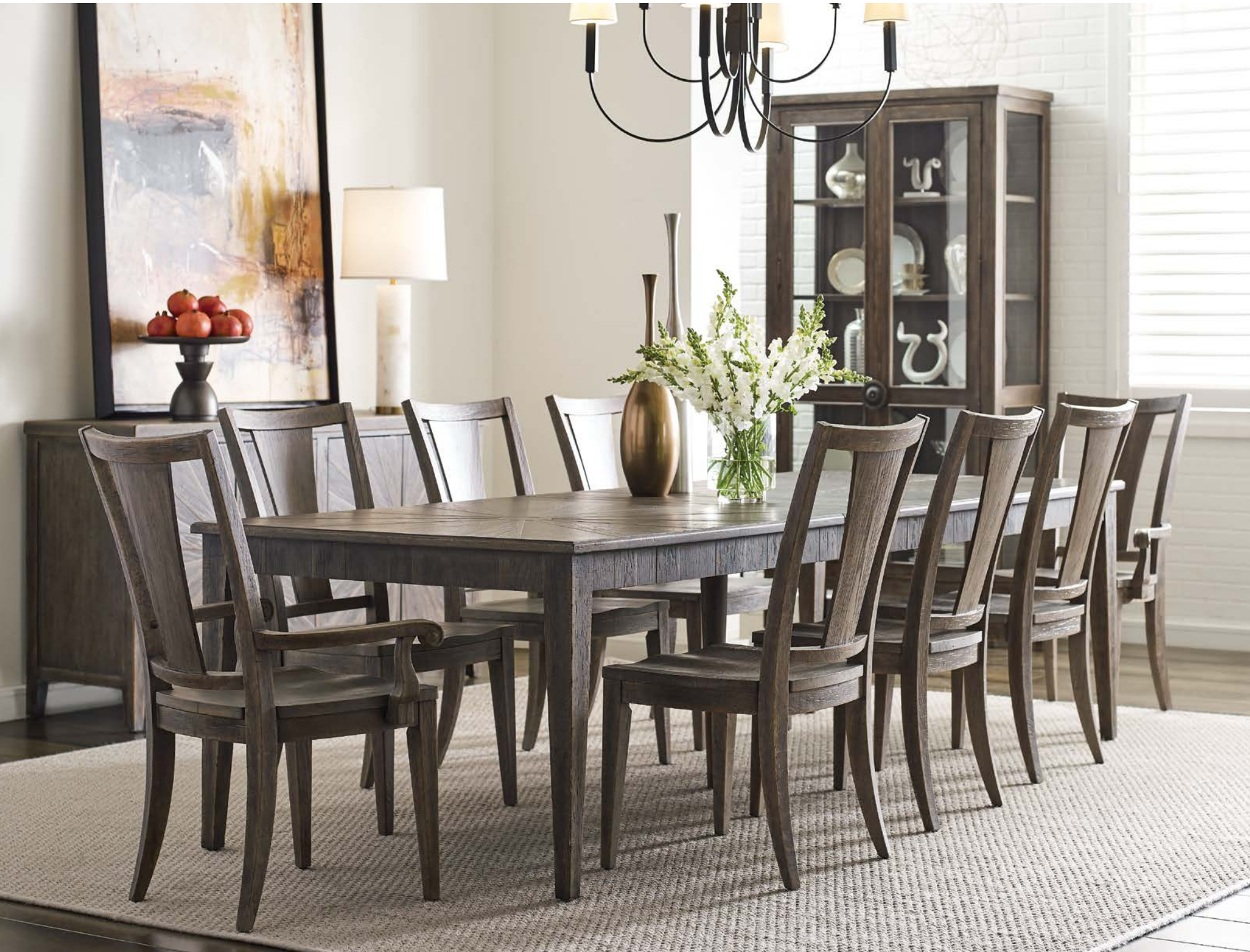
012-744 DARRELL RECTANGULAR DINING TABLE 012-636 MONTGOMERY SIDE CHAIR 012-637 MONTGOMERY ARM CHAIR 012-850 KISTLER BUFFET