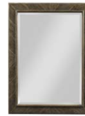
012-040 CORA MIRROR W36 D1½ H48 Beveled mirror pages: 4/5, 11