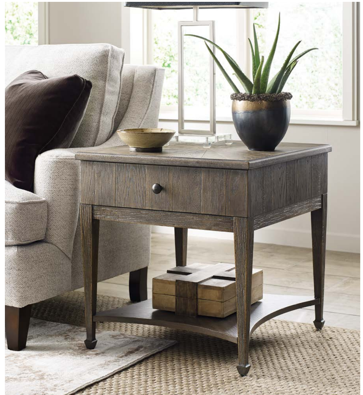
012-915 CARMINE DRAWER END TABLE