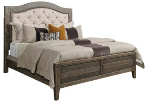
012-316R INGRAM KING UPHOLSTERED BED - COMPLETE 6/6 W80¾ D87⅞ H68⅞

W42 D18 H84 Adjustable levelers, four adjustable shelves, two wood-framed glass doors, can light, Each shelf size: W39 D15 pages: 12/13, 14, 16/17