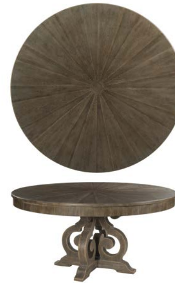
012-701R ELLSWORTH ROUND DINING TABLE - COMPLETE

W20 D23⅞ H40 Wood seat Seat Height: 18 Seat Depth: 18 pages: 12/13, 16/17