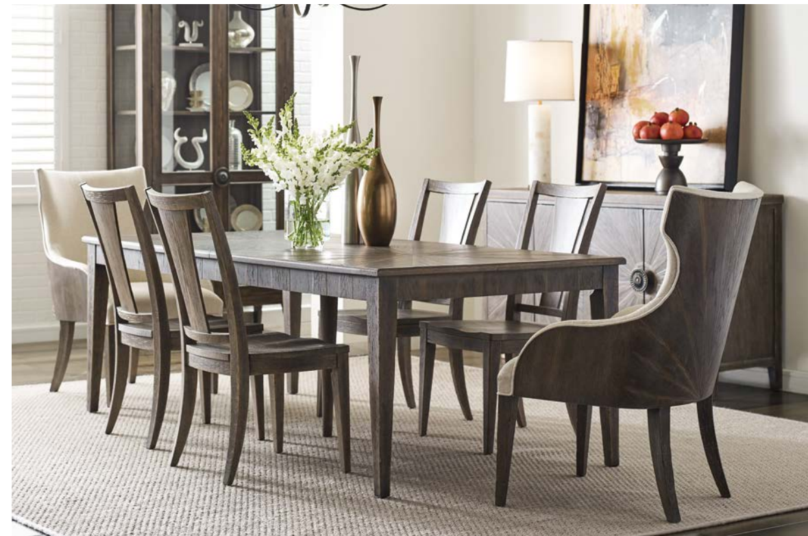
012-744 DARRELL RECTANGULAR DINING TABLE 012-636 MONTGOMERY SIDE CHAIR 012-622 ARMSTRONG UPHOLSTERED DINING HOST CHAIR 012-850 KISTLER BUFFET