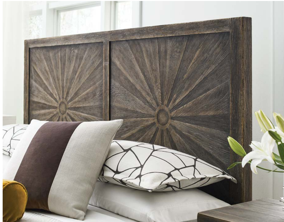
012-306R CHESWICK KING PANEL BED (headboard detail)