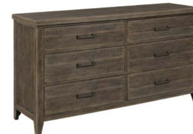
012-130 LOWELL SIX DRAWER DRESSER W66 D19 H36 Six drawers, center foot, removable brown jewelry tray in top right drawer, bottom two drawers are cedar lined, adjustable levelers pages: 4/5, 9, 11