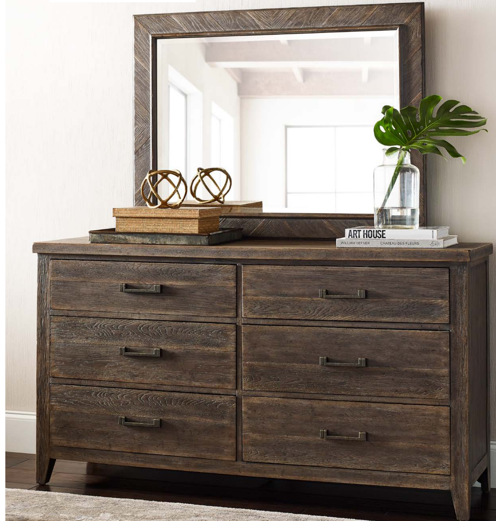
012-040 CORA MIRROR 012-130 LOWELL SIX DRAWER DRESSER