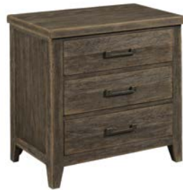
012-420 PARKER NIGHTSTAND W30 D18 H30

Three drawers, adjustable levelers, bottom drawer is Cedar lined, recessed area in back with a two plug outlet and usb port pages: 4/5, 7, 9