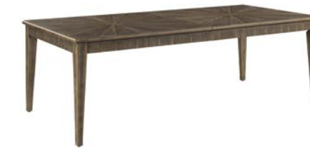
012-744 DARRELL RECTANGULAR DINING TABLE

W88 D42 H30 Adjustable levelers, two 20 inch leaves