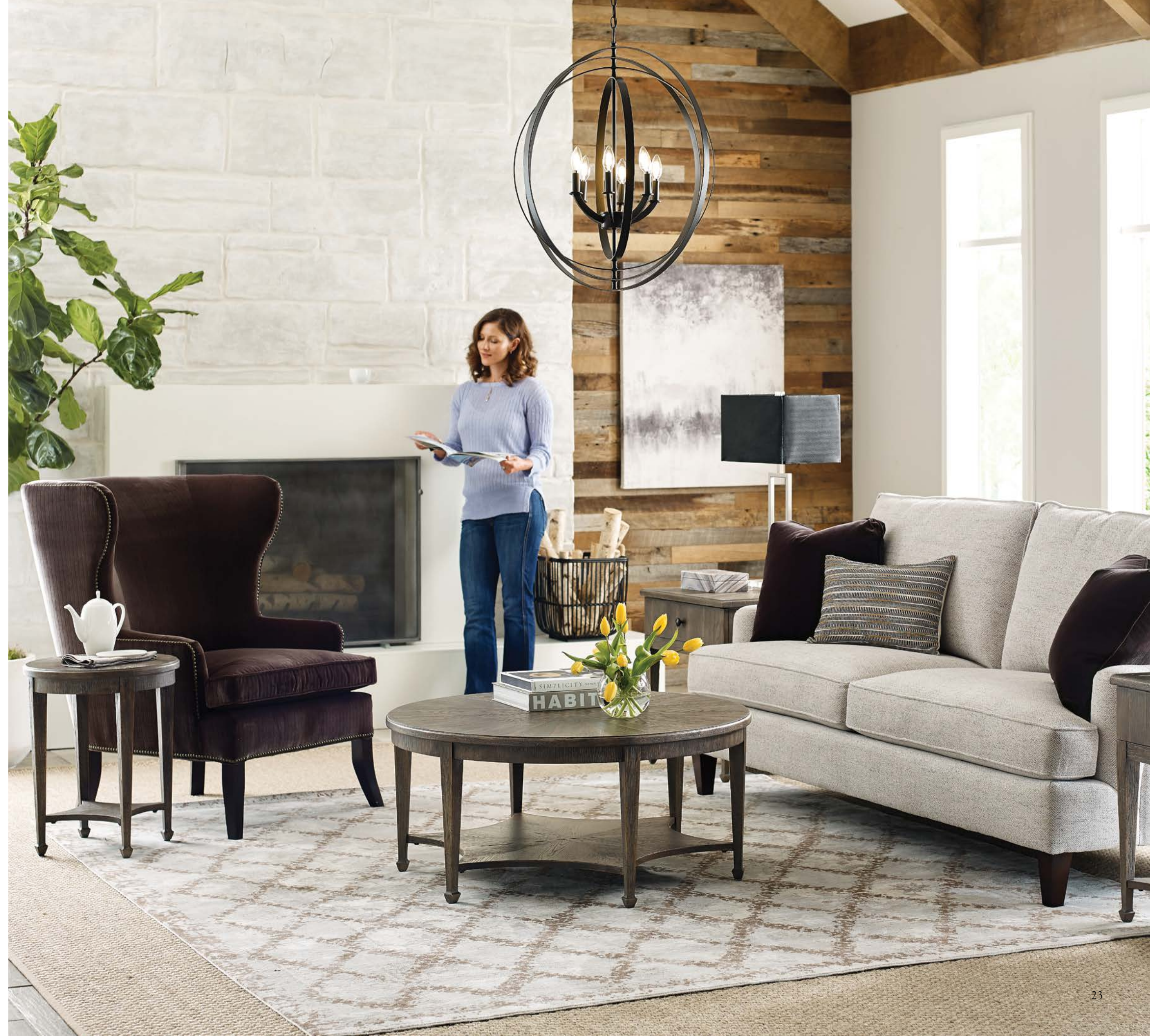
RIGHT: 012-911 SUTTER ROUND COFFEE TABLE 012-916 SUTTER ROUND END TABLE 012-915 CARMINE DRAWER END TABLE