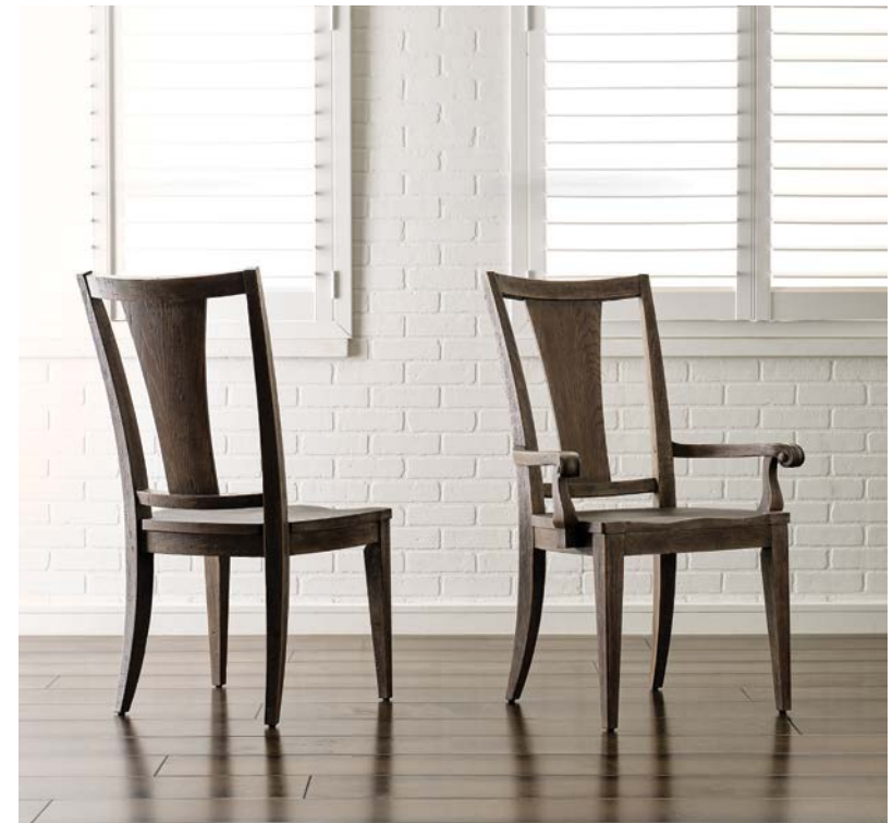
012-636 MONTGOMERY SIDE CHAIR, 012-637 MONTGOMERY ARM CHAIR