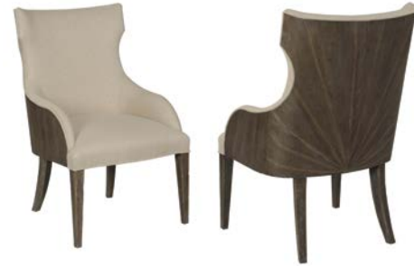
012-622 ARMSTRONG UPHOLSTERED DINING HOST CHAIR

W25¾ D26⅞ H41½ Upholstered seat Seat Height: 20 Seat Depth: 21 Arm Height: 24⅞ pages: 12/13, 15, 16/17