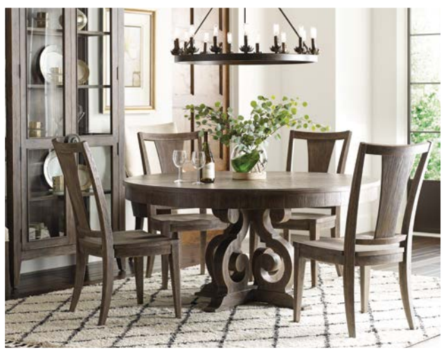
012-636 MONTGOMERY SIDE CHAIR 012-701R ELLSWORTH ROUND DINING TABLE 012-855 ACKERLY CURIO CABINET