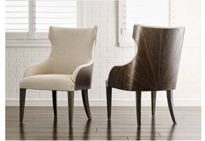
012-622 ARMSTRONG UPHOLSTERED DINING HOST CHAIR