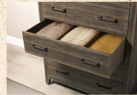
012-215 FARRELL DRAWER CHEST divider drawer detail

ART HOUSE WILLIAM HEFNER CHATEAU DES FLEURS