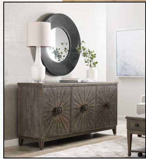
012-933 CROSLY ENTERTAINMENT CONSOLE