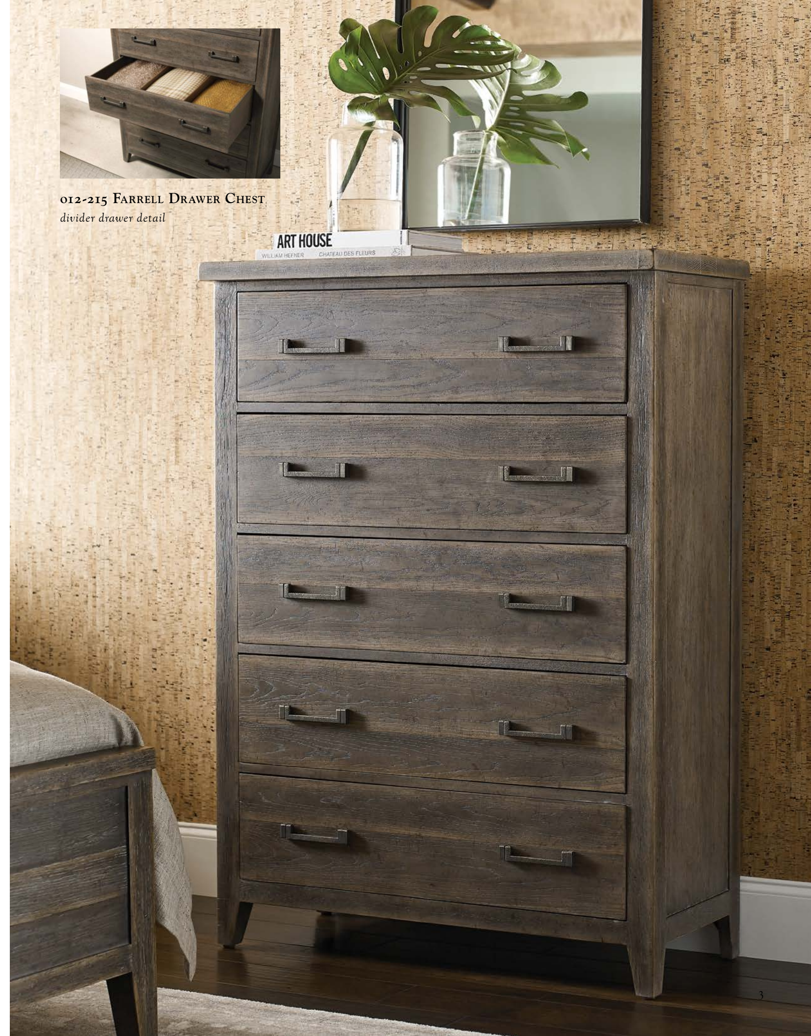
OPPOSITE PAGE: 012-215 FARRELL DRAWER CHEST

ART HOUSE WILLIAM HEFNER CHATEAU DES FLEURS