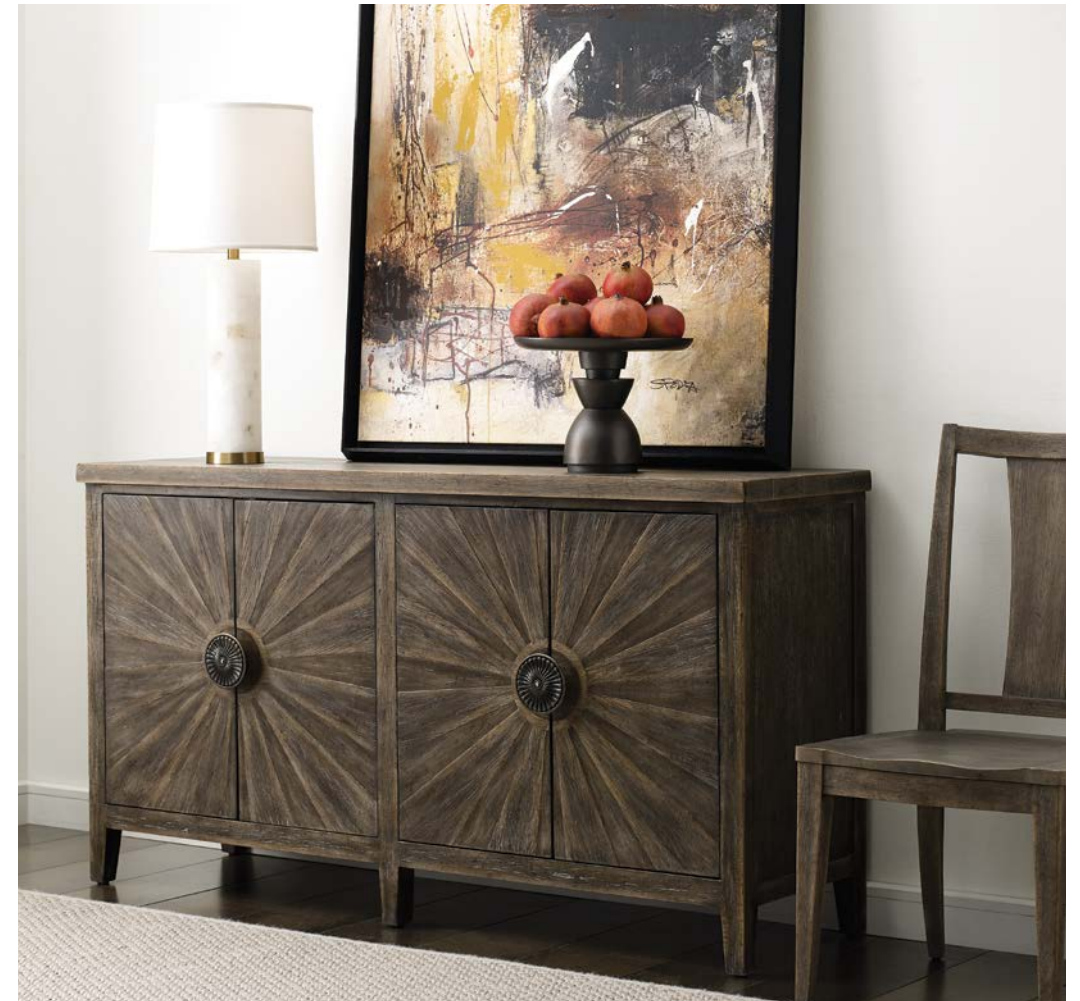
012-850 KISTLER BUFFET