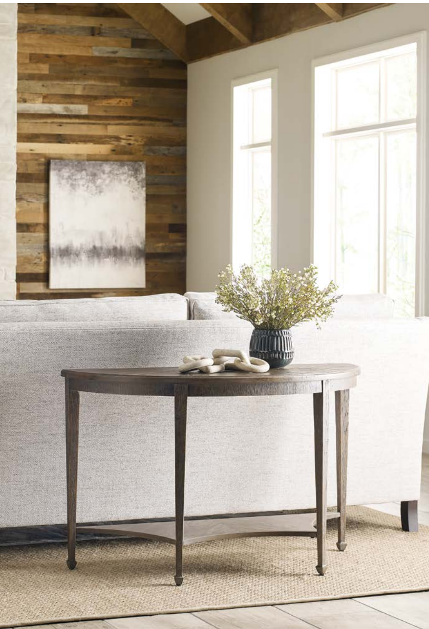
012-926 MAURICE DEMILUNE CONSOLE