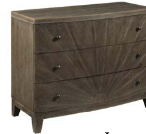
012-120 JOSEPHINE ACCENT CHEST W42 D19 H34 Three drawers, bottom drawer is Cedar lined, adjustable levelers pages: 8/9, 10