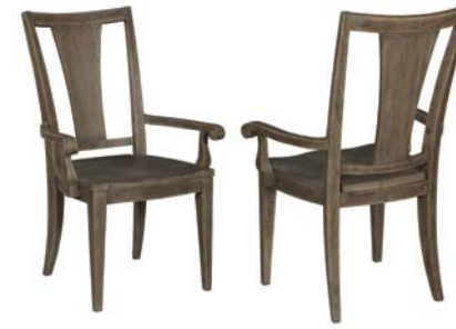
012-637 MONTGOMERY ARM CHAIR

W25¾ D26⅞ H41½ Upholstered seat Seat Height: 20 Seat Depth: 21 Arm Height: 24⅞ pages: 12/13, 15, 16/17