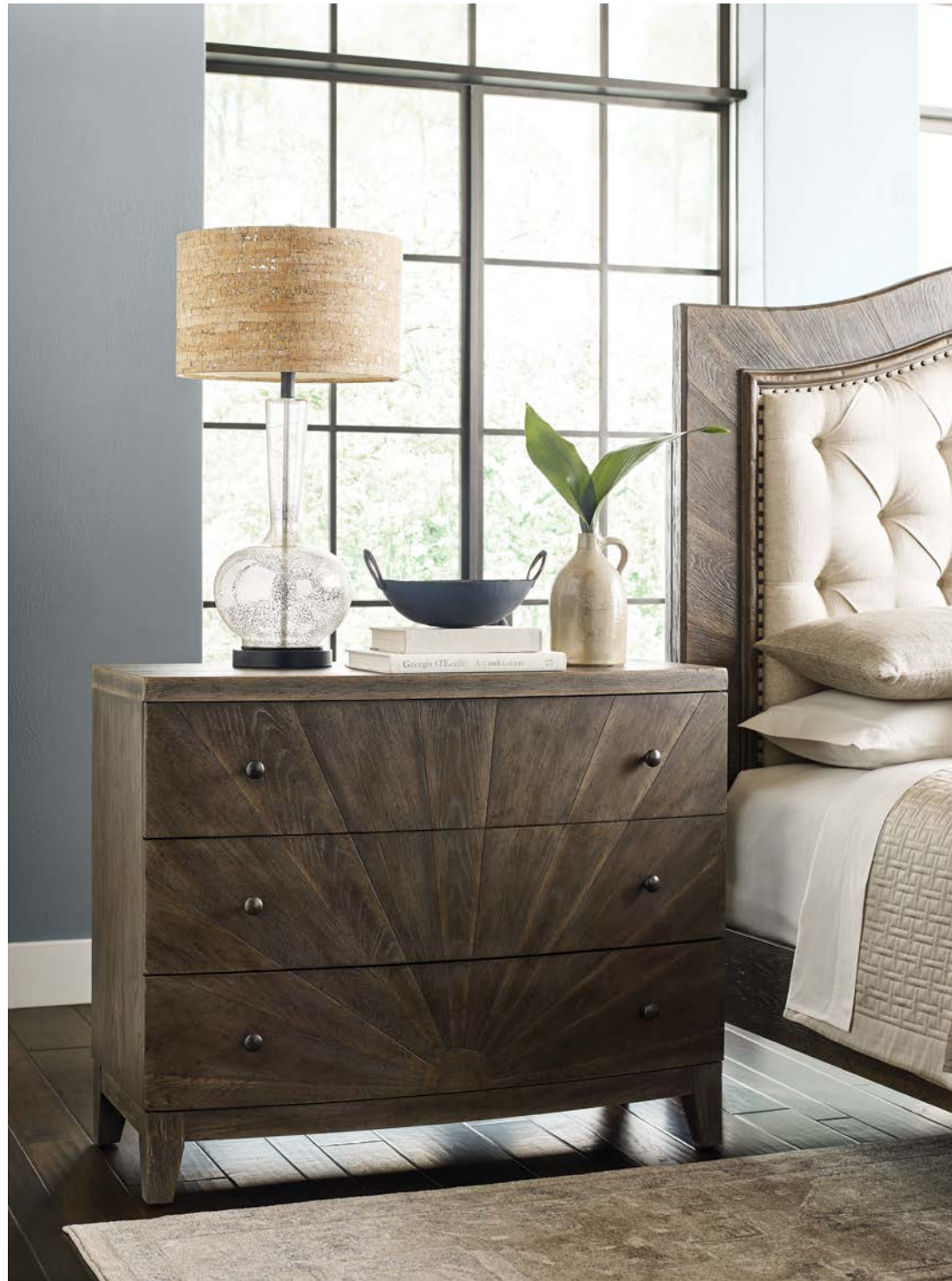
ABOVE: 012-120 JOSEPHINE ACCENT CHEST