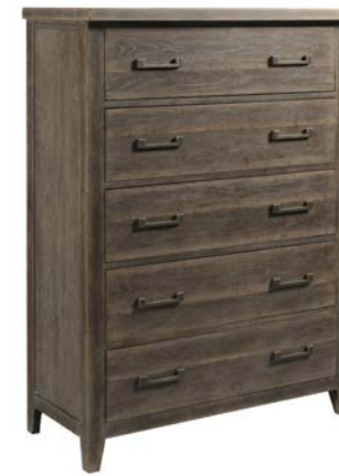
012-215 FARRELL DRAWER CHEST W42 D19 H58 Five drawers, second and third drawer from the top have drawer dividers, bottom drawer is cedar lined, adjustable levelers pages: 3, 8/9