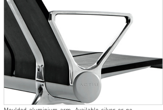
Moulded aluminium arm. Available silver or polished