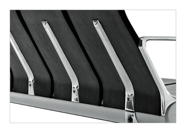
Lubar support in backs. Moulded aluminium. Available in silver or polished