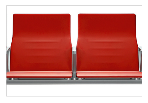
Independent seats and back available in plywood, polyurethane (PU) and steel