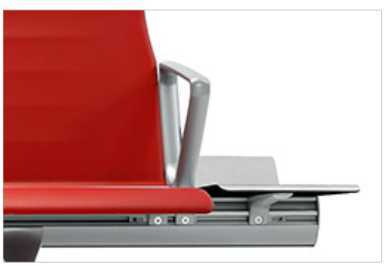
Auxiliary desk 22 x 44 cm steel plate, silver finish