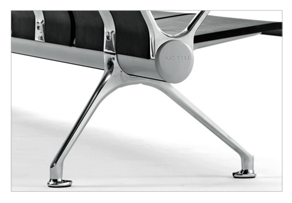
Moulded aluminium feet. Available in silver or polished. System to be fixed to the floor