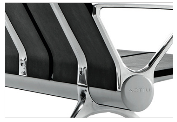
Extruded aluminium central beam. Available in silver finish. Ready to receive seats, backs, support legs and accessories